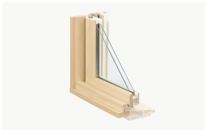
ULTREX FIBERGLASS EXTERIOR WITH WOOD INTERIOR.

This is the proprietary name for pultruded fiberglass from Marvin. Pultruded fiberglass is a game changer in the world of fiberglass production. Like some composite wood products, the process aligns fibers to increase strength. The process pulls continuous glass fibers known as fiberglass rovings through a die so that they are aligned and cut to suit the profile that is