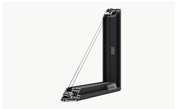
INTERIOR VIEW OF HIGH-DENSITY FIBERGLASS CORNER SECTION.

As a natural conductor, aluminum frames need to incorporate an effective thermal break to be energy efficient. With contemporary coating technologies, color and textures can be factory-applied that last 30+ years. The interior appearance of solid aluminum windows tends to blend best with contemporary or commercial interiors. Although aluminum is strong, it may also need additional reinforcement for long horizontal or vertical spans at intermediate mullions. Aluminum that is exposed to salt water and coastal environments can show pitting and corrosion without proper coatings or protection.