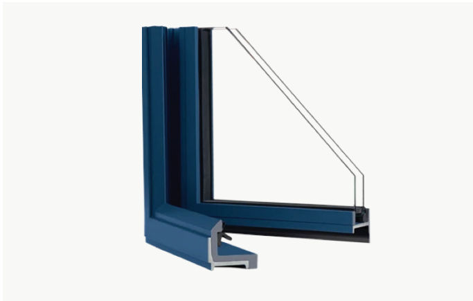
THERMALLY BROKEN STEEL WINDOW.

Window and door frames have been made of steel since the mid-1800's. It was very popular in the early 1900's and then faded in use due to materials shortages after World War II, when alternative materials like aluminum became available. Due to its high cost, its use is primarily for the high-end custom home market and light commercial projects. Steel windows can cost two to four times as much as a similar-sized extruded aluminum wood-clad window. The primary benefit of steel is that, due to its strength, the frames can be quite narrow, resulting in elegant and sleek sightlines. Steel window frames are hot-rolled sections that allow for fixed glazing and operable sash of all types. It excels at larger openings due to its overall strength and stiffness. With the introduction of thermal breaks in the frame, which makes the frame larger, some of the benefits of the narrow steel frame are sacrificed. The thermal breaks are, however, essential for adequate and code-compliant thermal performance.