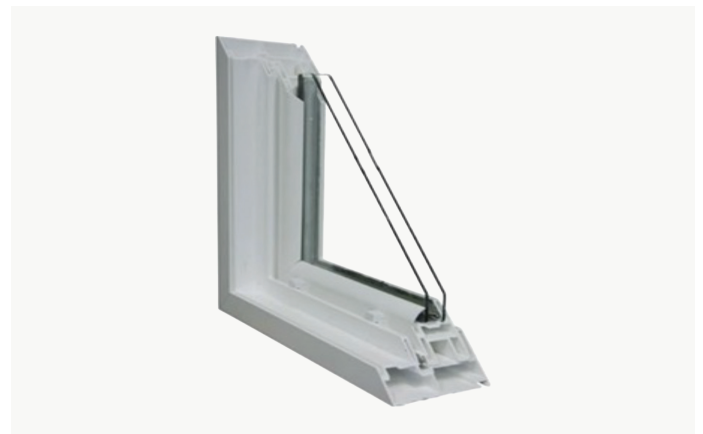
CORNER SAMPLE OF VINYL WINDOW.

Vinyl is a natural insulator and resists any damage due to exposure to water. It is, however, typically limited in color selections, and due to its low flexural strength, it may be inappropriate for larger openings. Vinyl frames can be reinforced with steel inserts to increase strength, but these inserts can be deleterious to thermal performance.