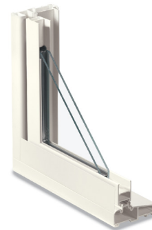
All fiberglass window with Low E2 coating

The material that the sash and frame are made out of can vary significantly in both appearance and performance. Wood has been the traditional choice, particularly in residential designs, which is generally attractive but needs ongoing maintenance to keep the wood durable. Aluminum is a durable alternative but does not provide the energy performance or condensation control in the frame that is usually required. Vinyl has become a popular choice, including fiberglass reinforced vinyl, since it generally overcomes the performance shortcomings of wood or aluminum, although their aesthetic is not universally accepted, particularly for higher end homes. However, not all vinyl is created equal, and some vinyl windows are not as durable over time - they may become brittle or may sag out of shape.