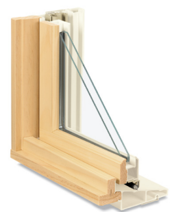
Fiberglass window with wood interior and Low E1 coating

An alternative is provided in window products that combine wood interiors with aluminum clad or fiberglass exteriors thus combining preferred aesthetics with superior energy performance and durability. Some manufacturers include different species of wood (i.e., Douglas fir, white oak, Mahogany, etc.) which can be denser and longer lasting than others and also provide different appearances and colorations. It is always best to check with manufacturers for their standard and optional offerings.