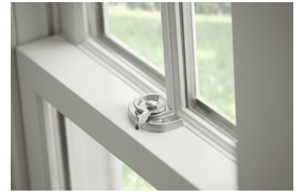
Double-hung window with sash lock hardware.

The hardware for operable windows is similarly varied by manufacturer. While the functionality of the hardware is essentially the same between one manufacturer and another, the style, color, and finish of that hardware can vary considerably. Some offer multi-point locking hardware on selected products which provides a greater degree of security. The hardware can also play an important role in sealing sash together such as on a double hung or sliding type of window. Therefore, it should be assessed for its effectiveness in that regard as well as its aesthetics.