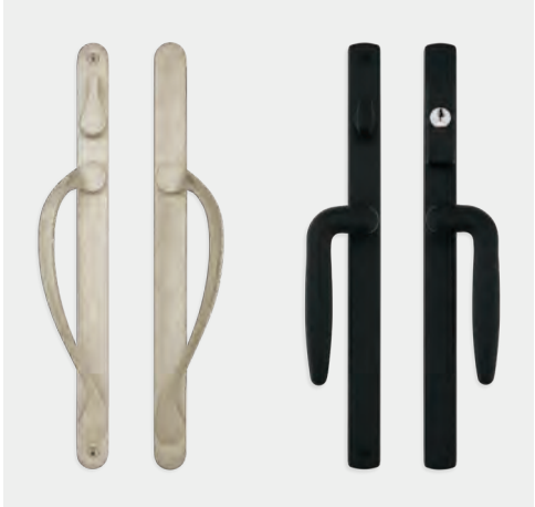
CAMBRIDGE HANDLES SHOWN IN SATIN NICKEL