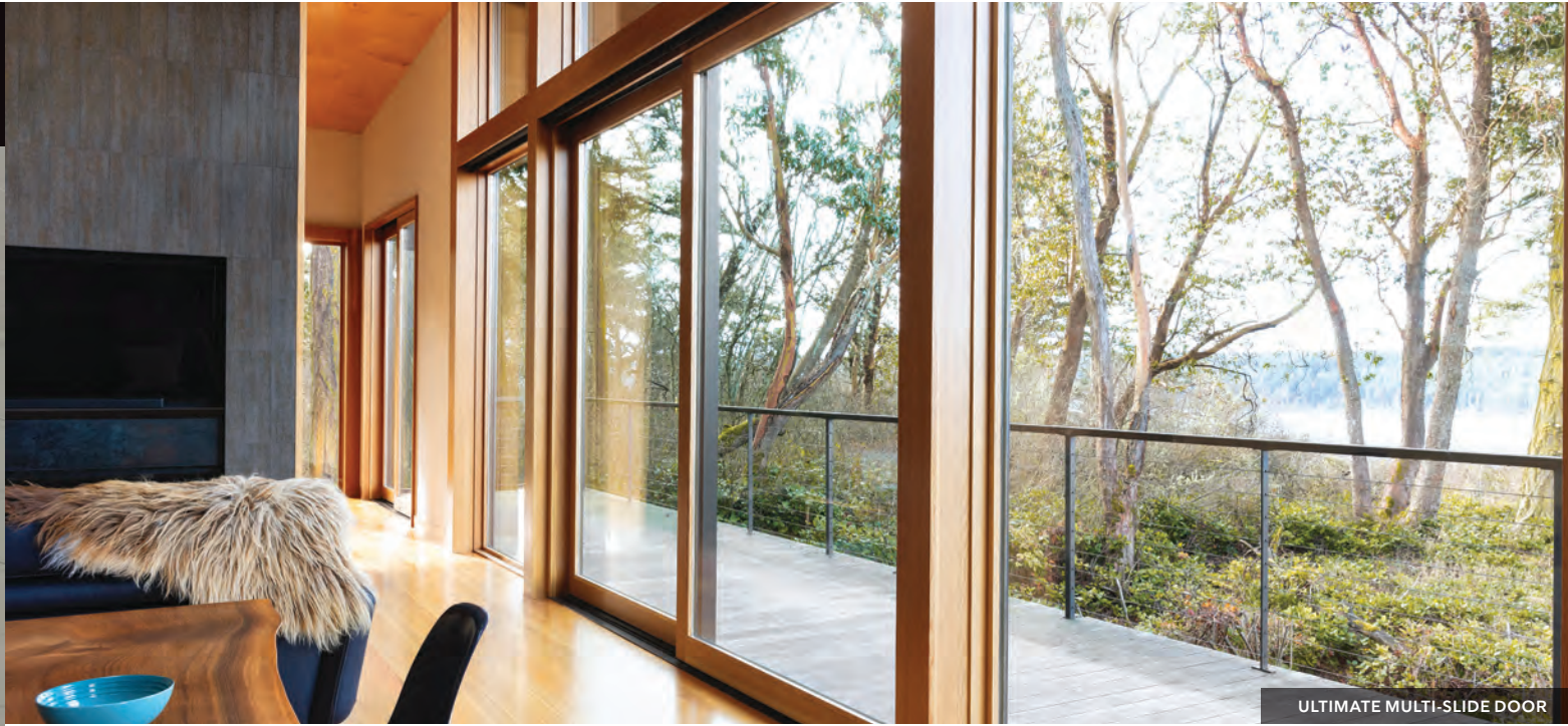
ULTIMATE MULTI-SLIDE DOOR