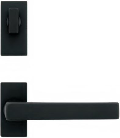
MINIMALIST HANDLE IN MATTE BLACK