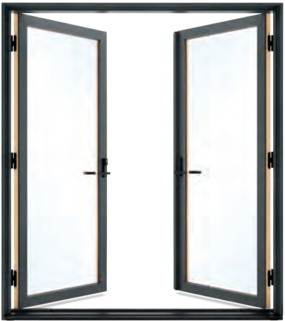
EXTERIOR VIEW OF INSWING