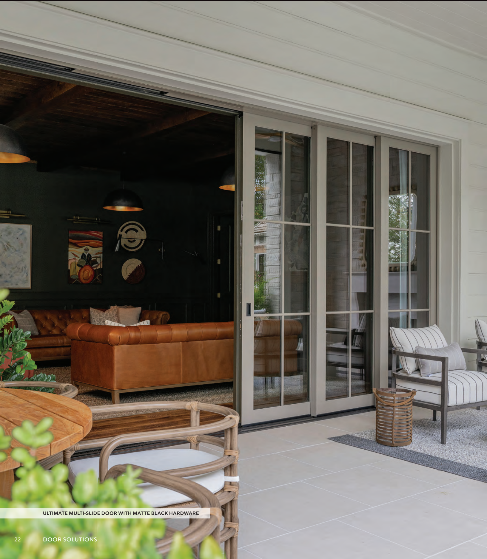
ULTIMATE MULTI-SLIDE DOOR WITH MATTE BLACK HARDWARE