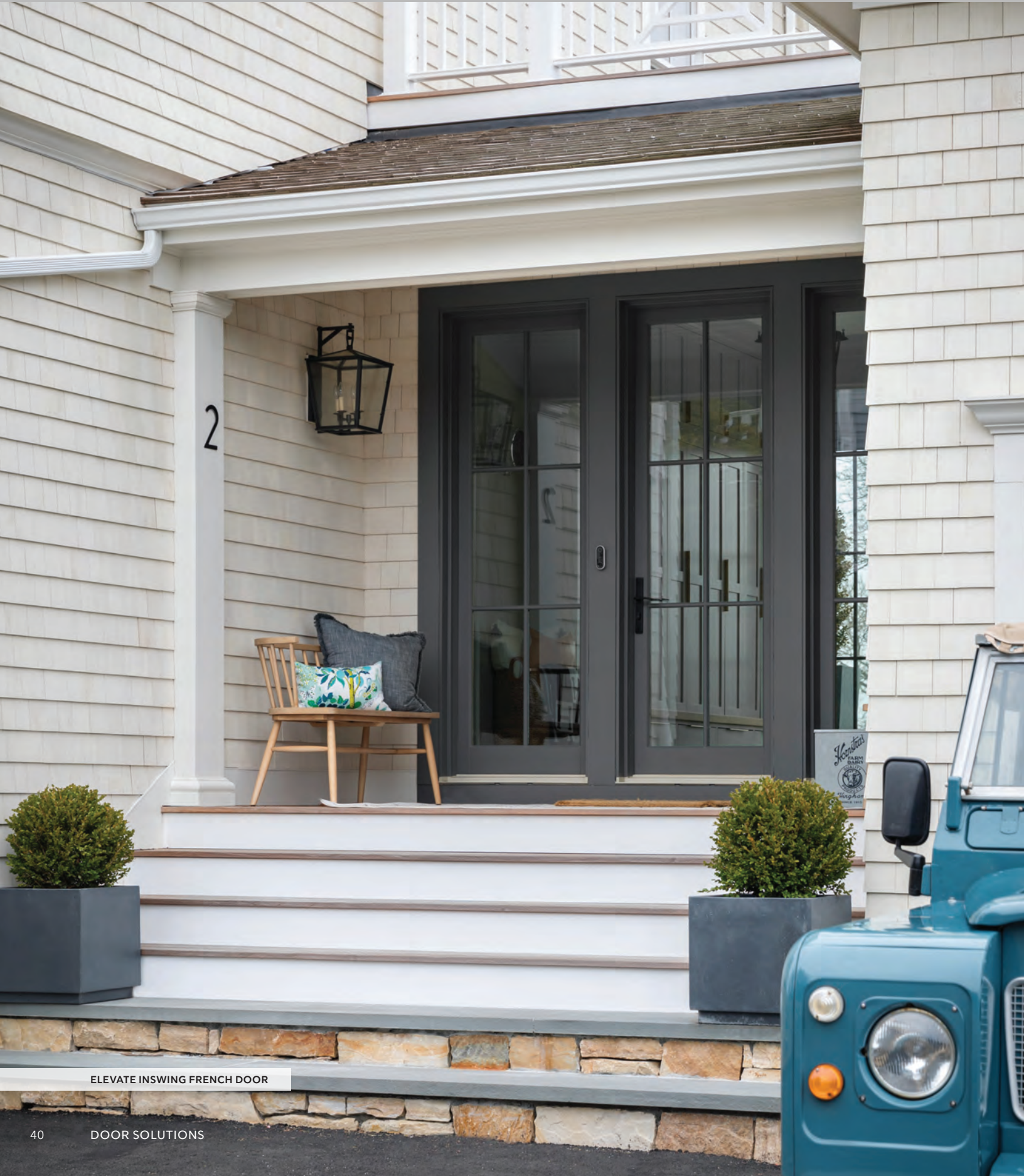
ELEVATE INSWING FRENCH DOOR