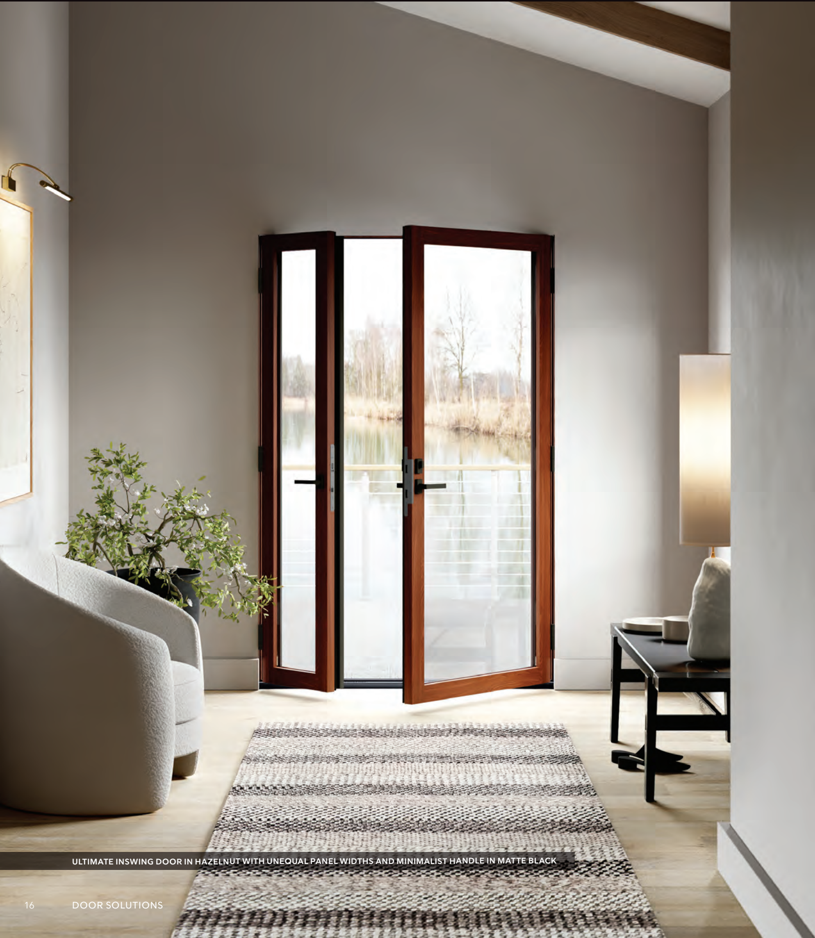
ULTIMATE INSWING DOOR IN HAZELNUT WITH UNEQUAL PANEL WIDTHS AND MINIMALIST HANDLE IN MATTE BLACK