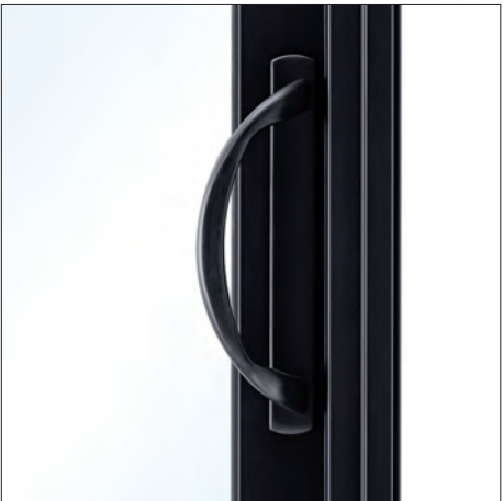
CAMBRIDGE HANDLE SHOWN IN MATTE BLACK