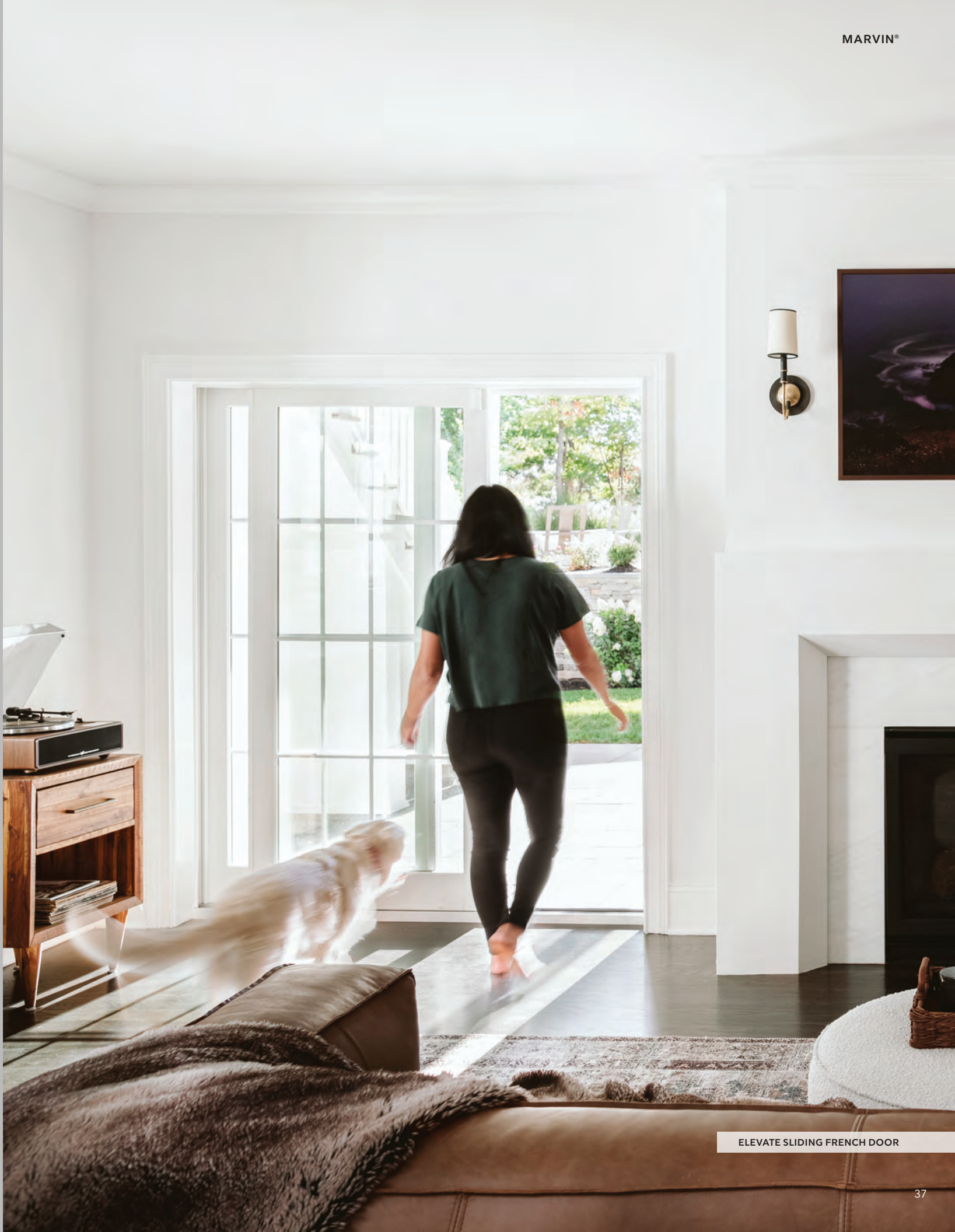
ELEVATE SLIDING FRENCH DOOR

Marvin Elevate® products provide the ideal blend of remarkable design and superior performance through a curated collection of the most popular products and options, warm wood interiors, and high-quality Ultrex® fiberglass exteriors that perform even in the harshest climates.