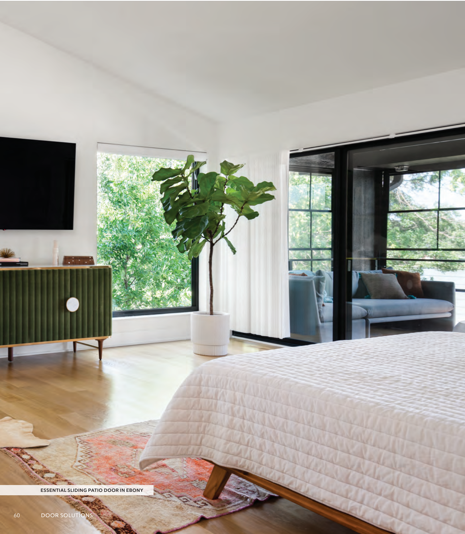
ESSENTIAL SLIDING PATIO DOOR IN EBONY