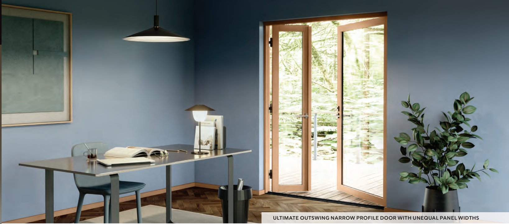
ULTIMATE OUTSWING NARROW PROFILE DOOR WITH UNEQUAL PANEL WIDTHS