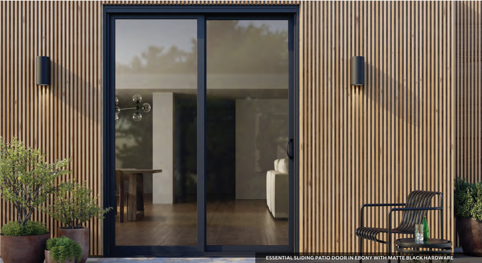
ESSENTIAL SLIDING PATIO DOOR IN EBONY WITH MATTE BLACK HARDWARE