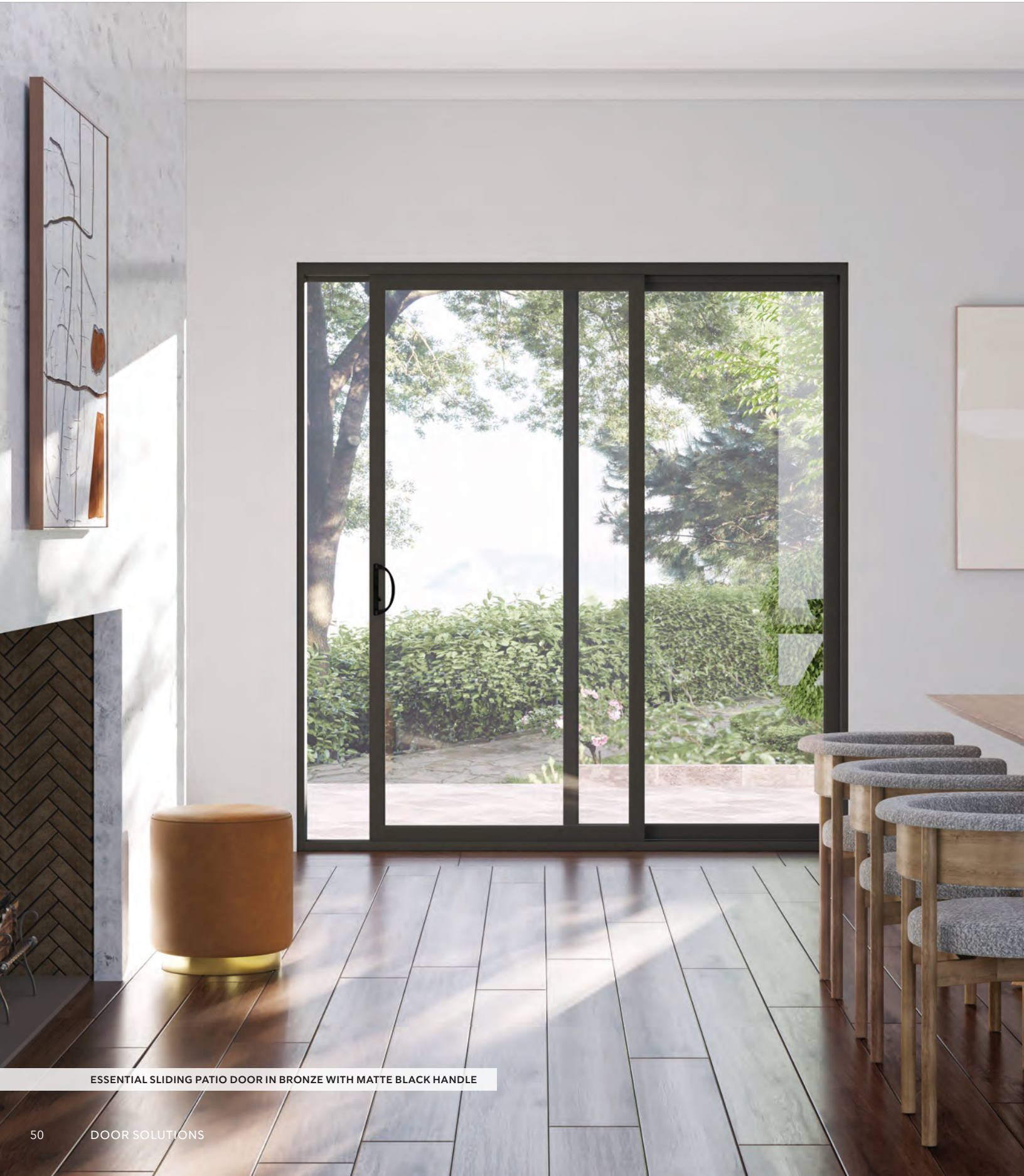
ESSENTIAL SLIDING PATIO DOOR IN BRONZE WITH MATTE BLACK HANDLE