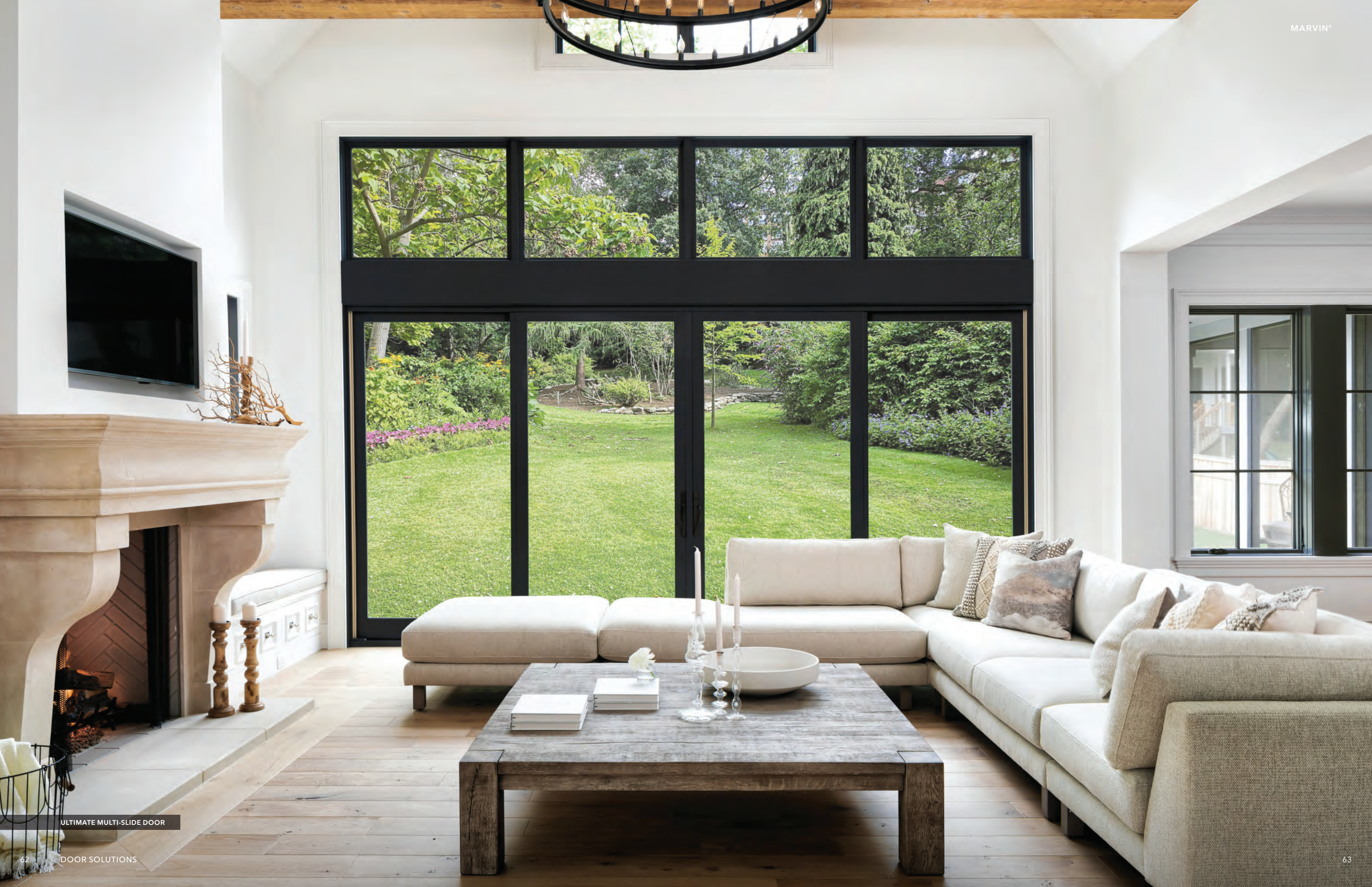
ULTIMATE MULTI-SLIDE DOOR