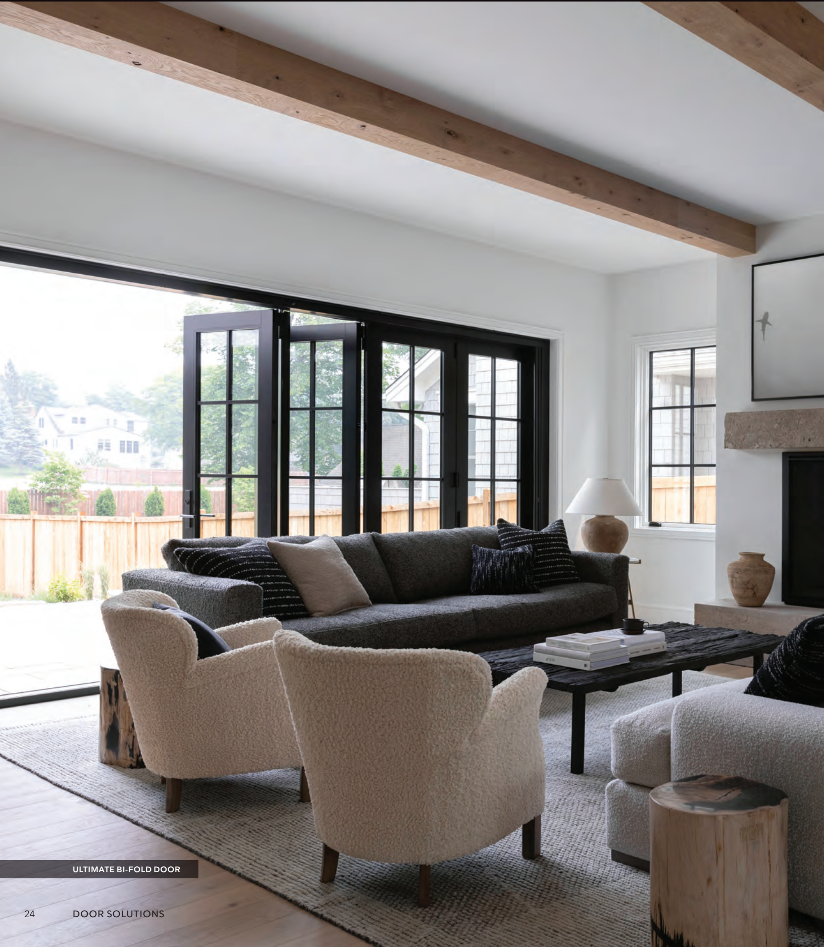
ULTIMATE BI-FOLD DOOR