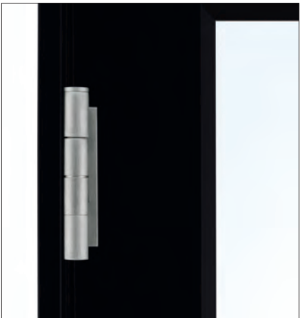
DOOR HINGE SHOWN IN SATIN NICKEL