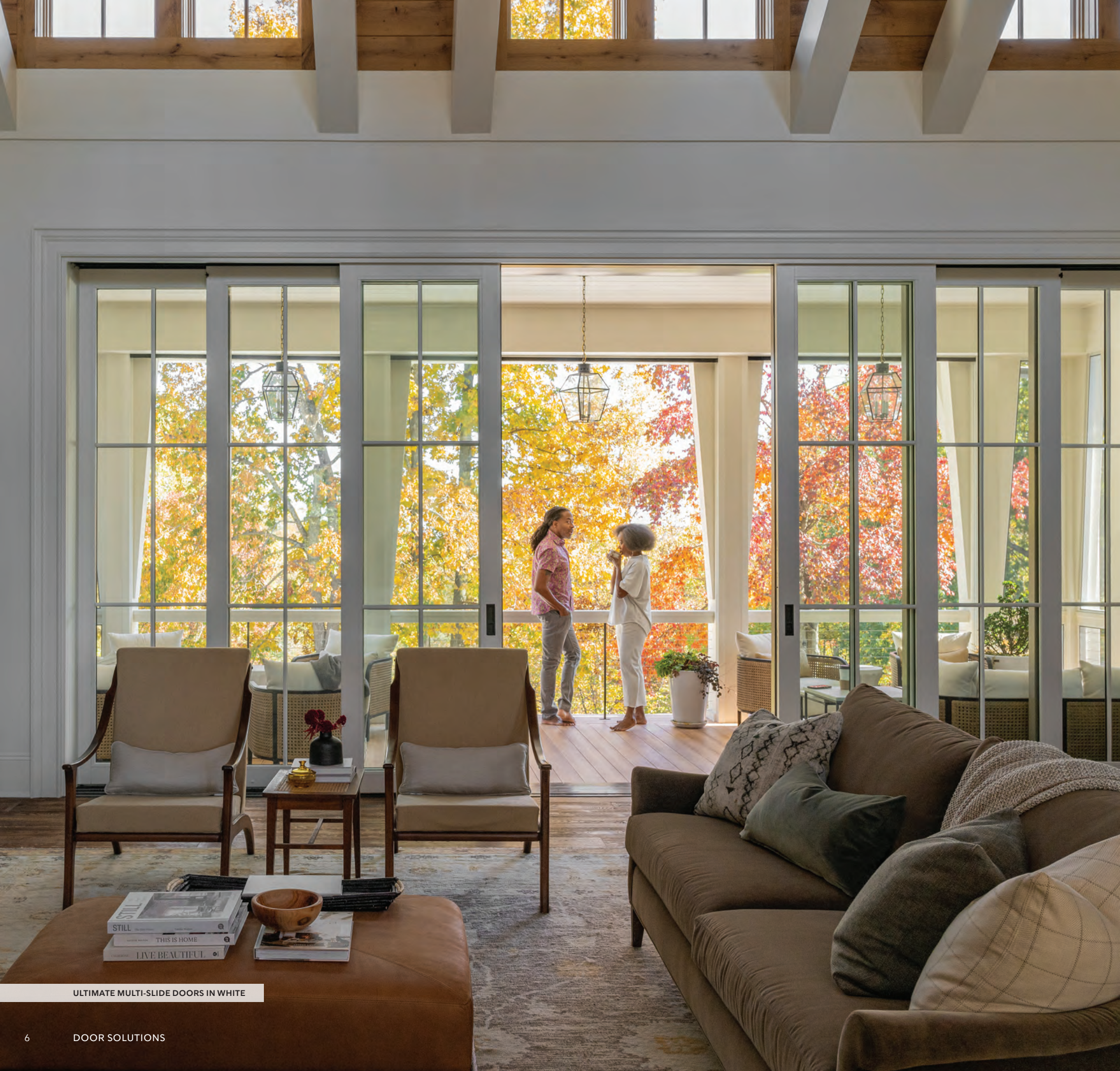
ULTIMATE MULTI-SLIDE DOORS IN WHITE