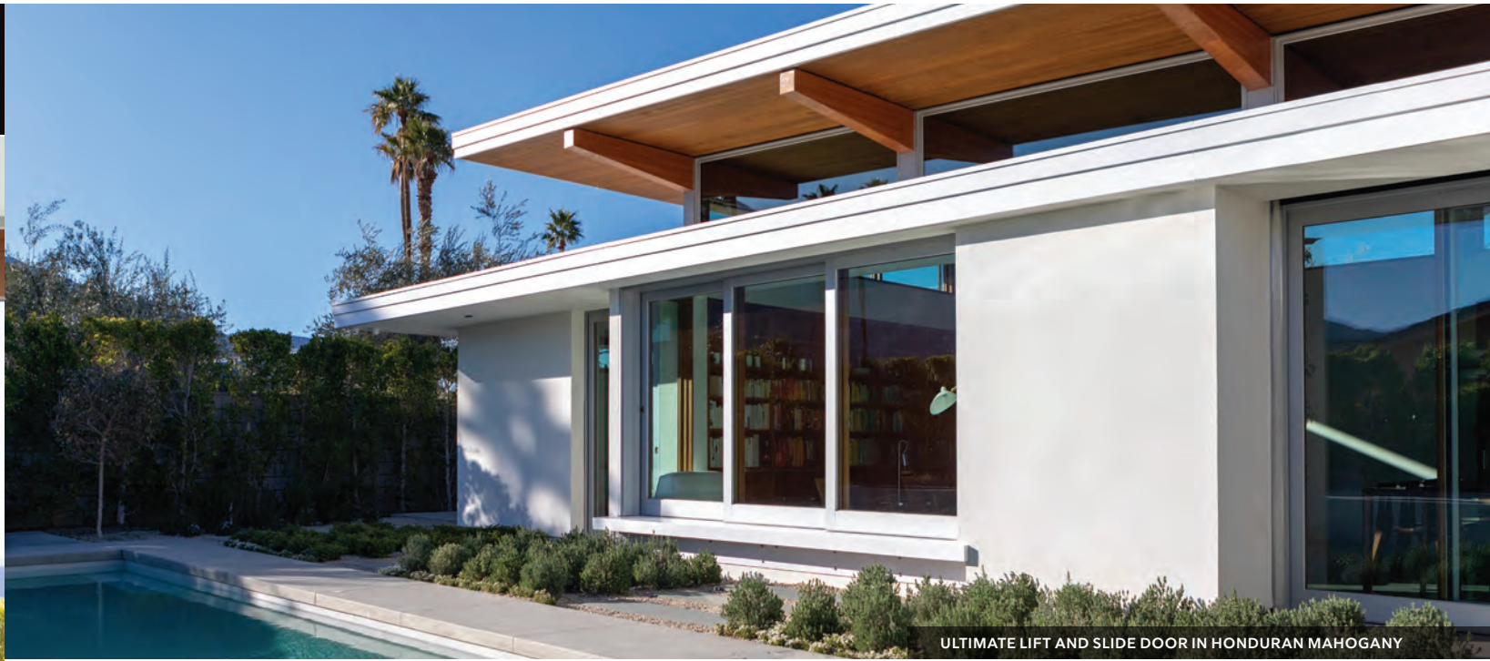
ULTIMATE LIFT AND SLIDE DOOR IN HONDURAN MAHOGANY