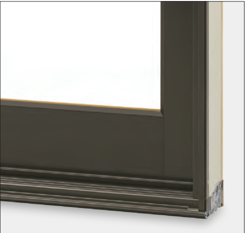
SILL DETAIL SHOWN IN BRONZE