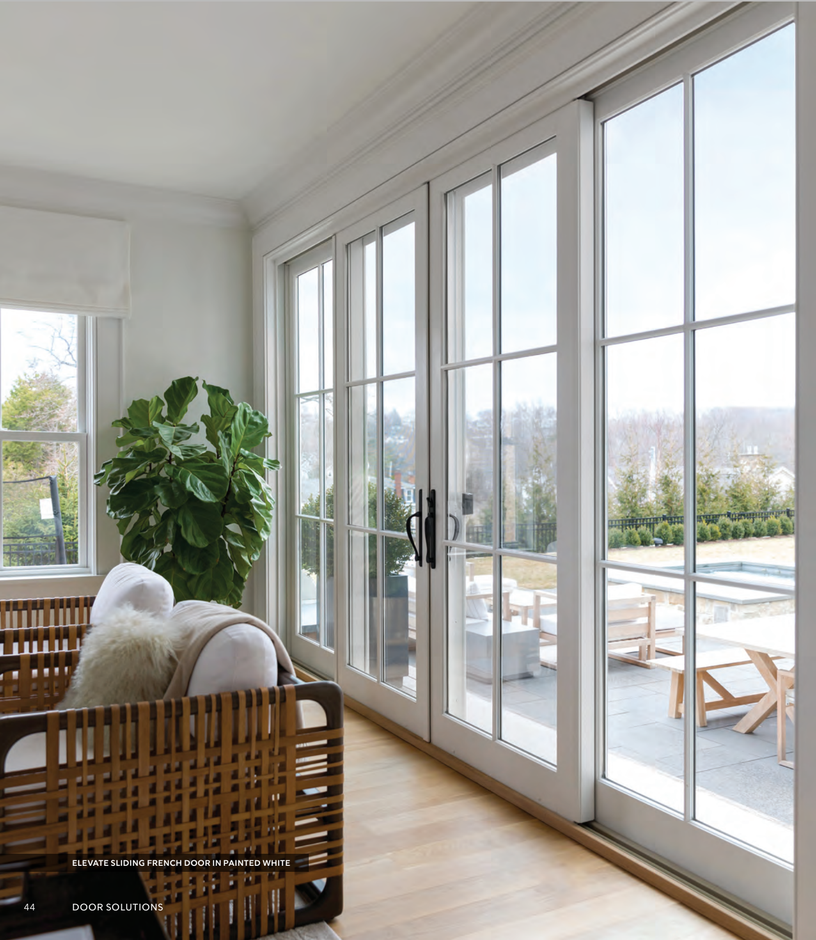
ELEVATE SLIDING FRENCH DOOR IN PAINTED WHITE