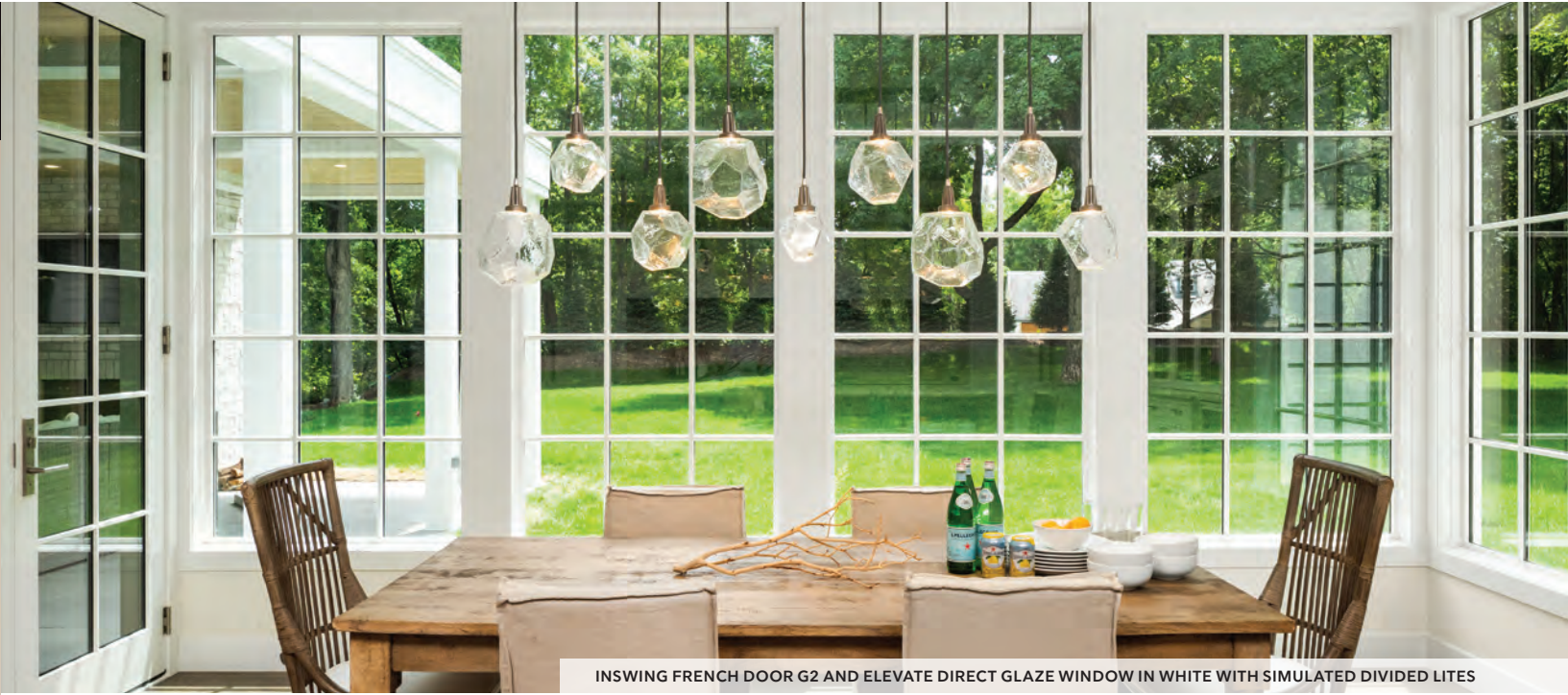
INSWING FRENCH DOOR G2 AND ELEVATE DIRECT GLAZE WINDOW IN WHITE WITH SIMULATED DIVIDED LITES