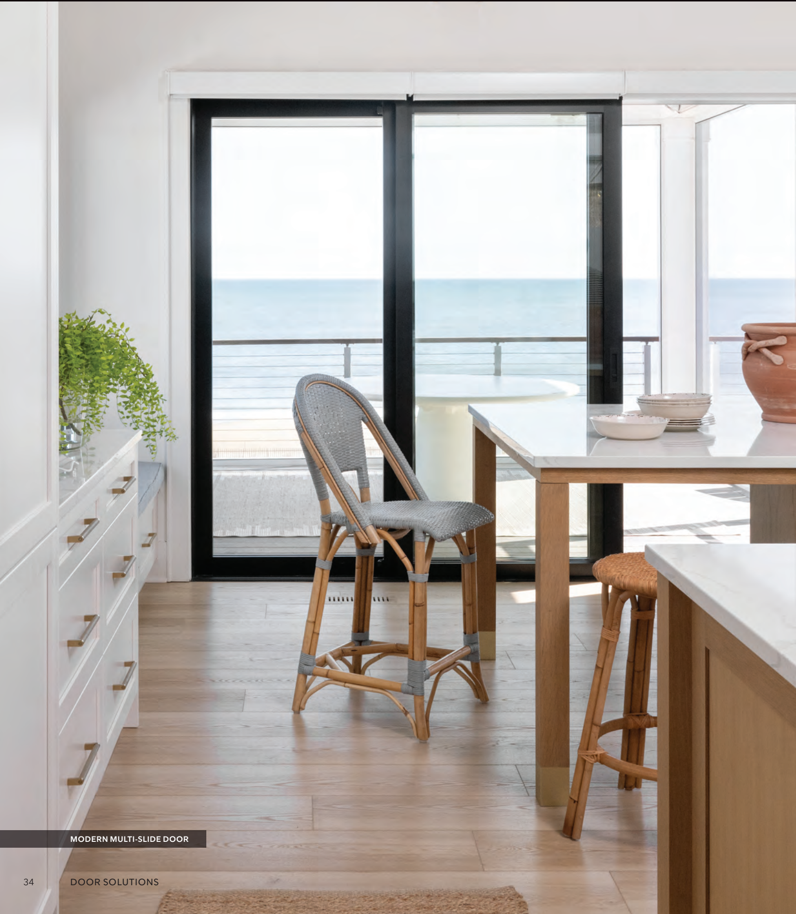
MODERN MULTI-SLIDE DOOR