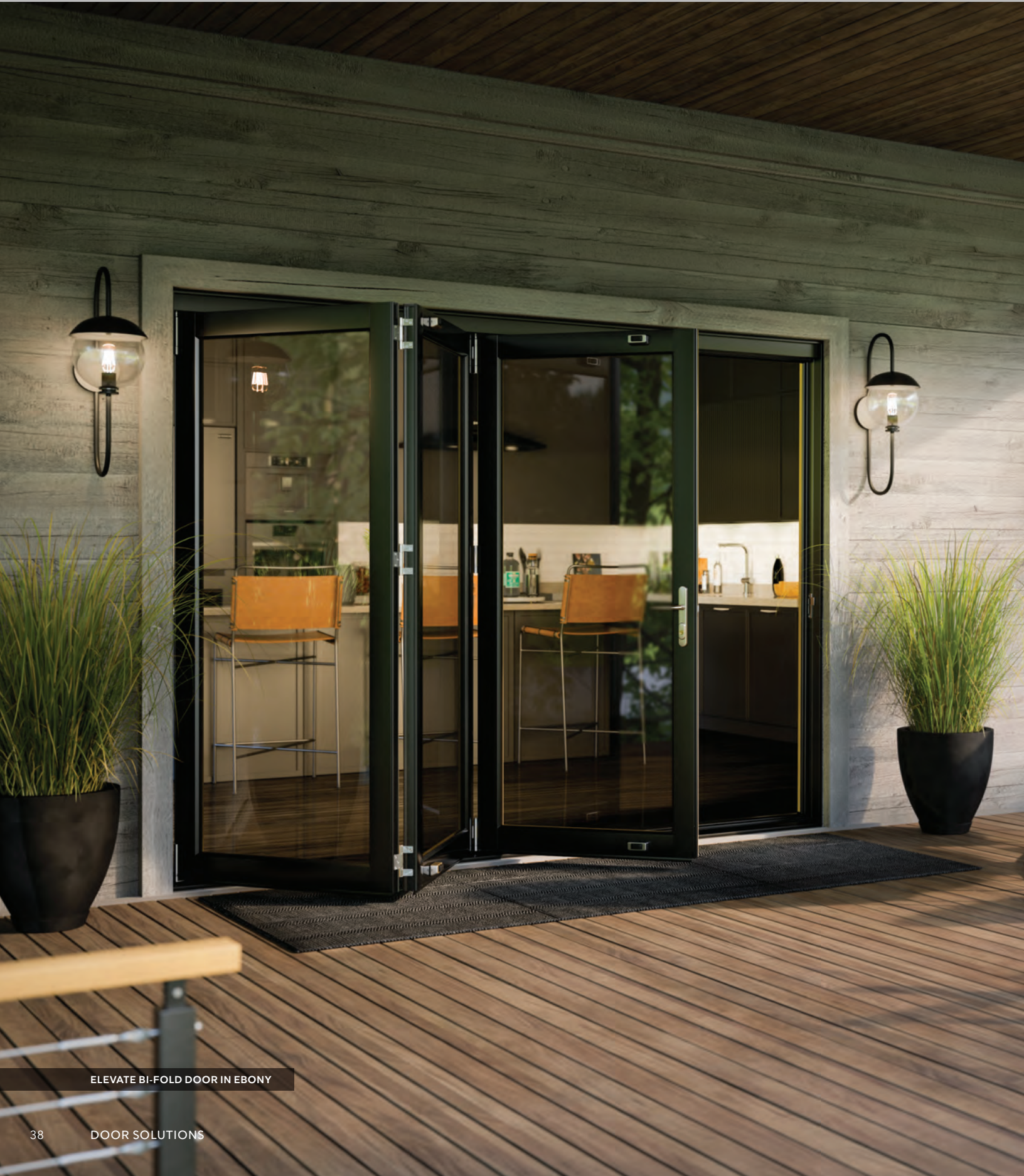
ELEVATE BI-FOLD DOOR IN EBONY