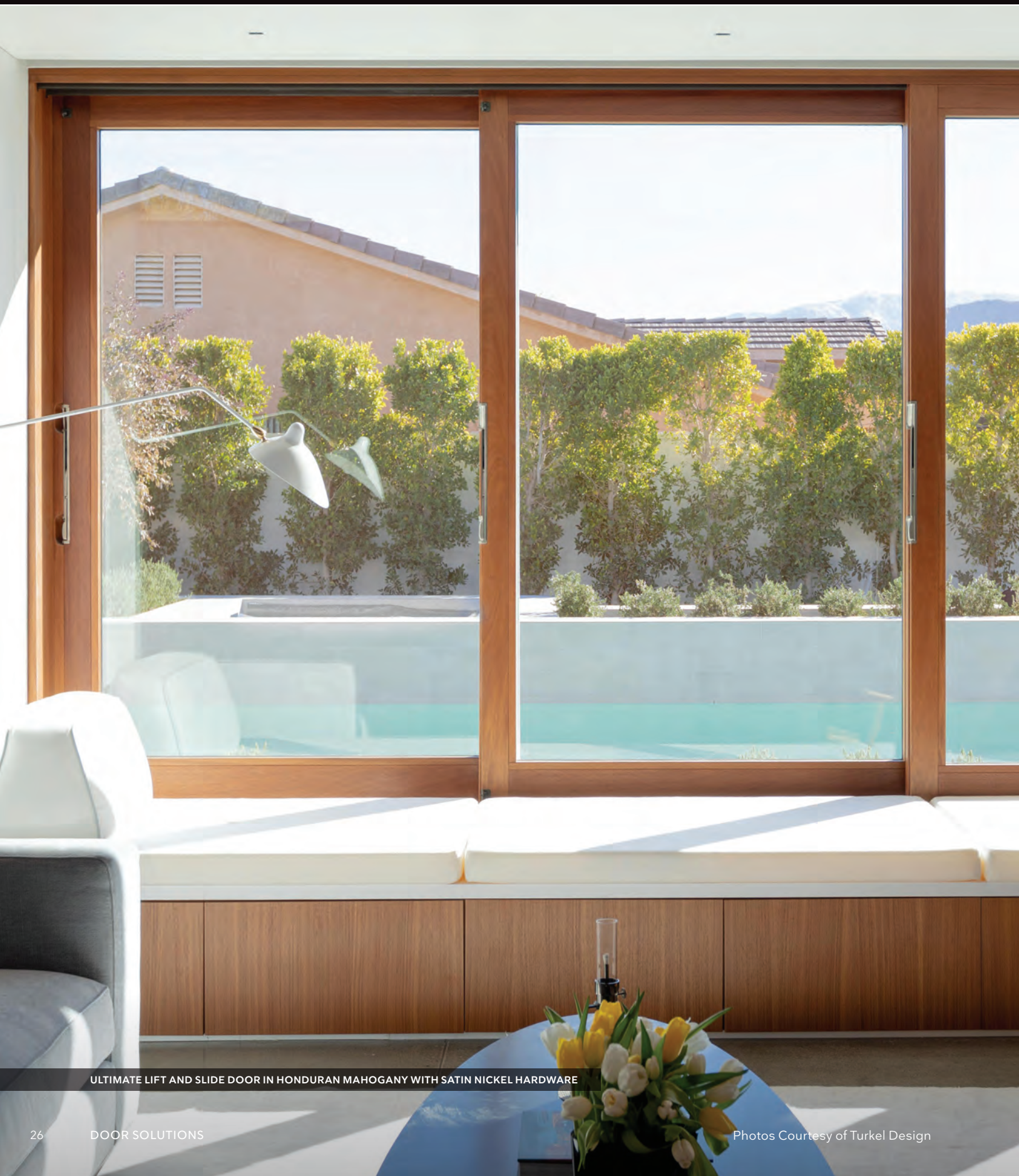
ULTIMATE LIFT AND SLIDE DOOR IN HONDURAN MAHOGANY WITH SATIN NICKEL HARDWARE