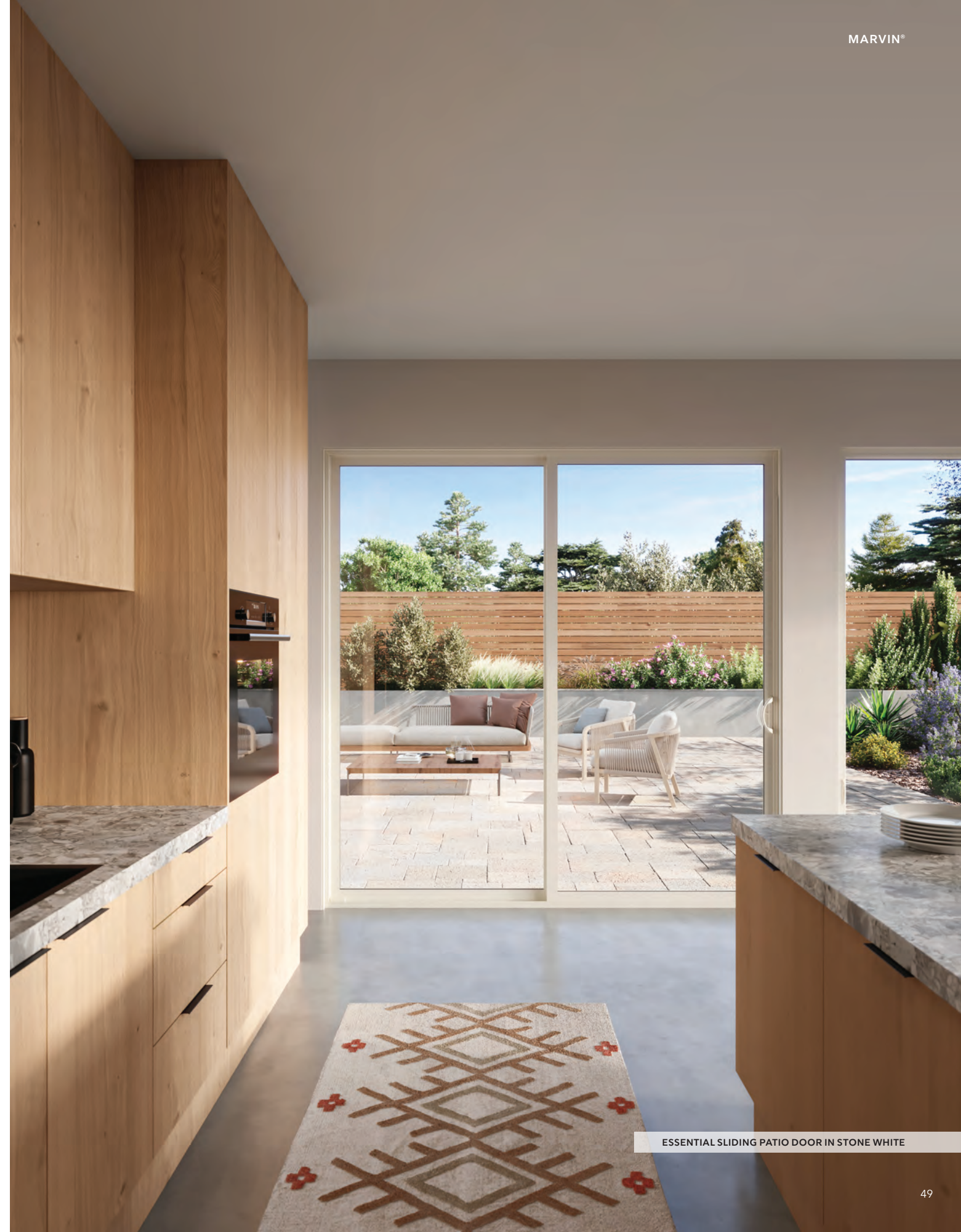
ESSENTIAL SLIDING PATIO DOOR IN STONE WHITE

Marvin Essential® products offer a simple approach to contemporary design and leading performance. A streamlined, easy-to-order product collection features durable, virtually maintenance-free Ultrex® fiberglass exteriors and interiors for a precise fit and finish.