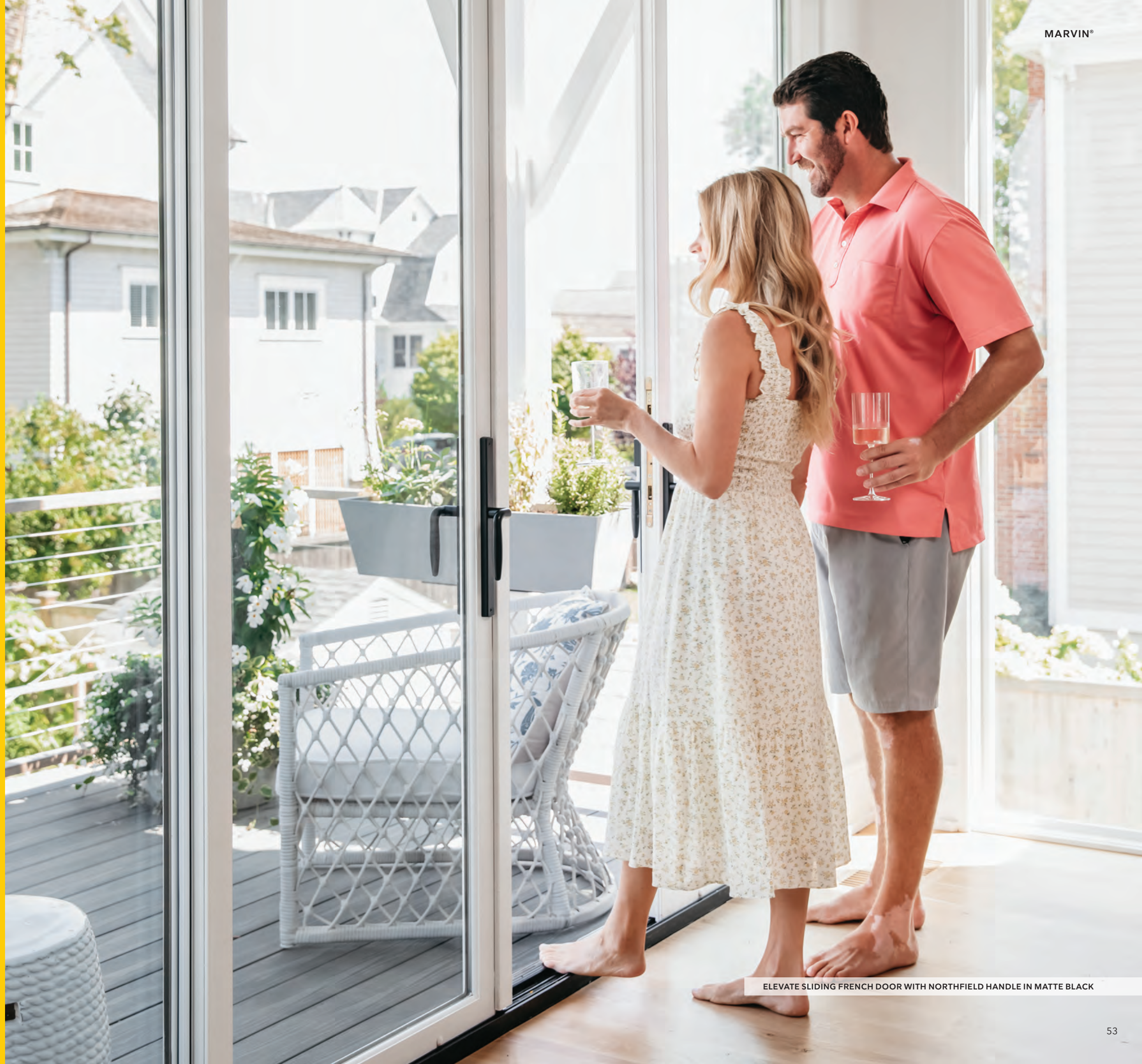
ELEVATE SLIDING FRENCH DOOR WITH NORTHFIELD HANDLE IN MATTE BLACK

EXTERIORS INTERIORS SIZING DESIGN FLEXIBILITY HARDWARE COASTAL / WATERFRONT MARKET AVAILABILITY