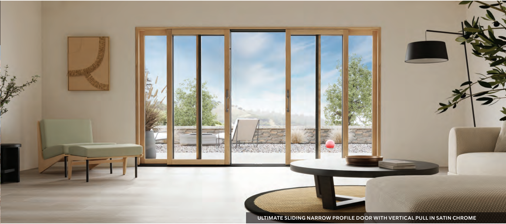
ULTIMATE SLIDING NARROW PROFILE DOOR WITH VERTICAL PULL IN SATIN CHROME