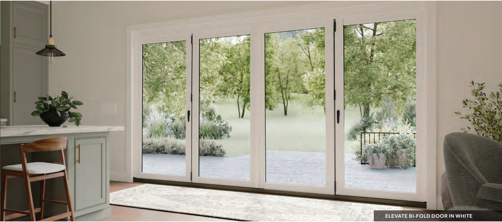
ELEVATE BI-FOLD DOOR IN WHITE

Reimagine how you live and entertain with the Marvin Elevate Bi-Fold door. Effortlessly slide and stack the door open to frame your own scenic view and invite maximum airflow into your home. When completely closed, the Elevate Bi-Fold door is designed with narrow profiles to fill your home with light. Only the Elevate Bi-Fold door is built with Ultrex® fiberglass on the exterior for virtually no-maintenance performance, including rich wood featured on the interior. Options are available in configurations up to 7 panels and fits openings up to 22 feet wide by 8 feet high.