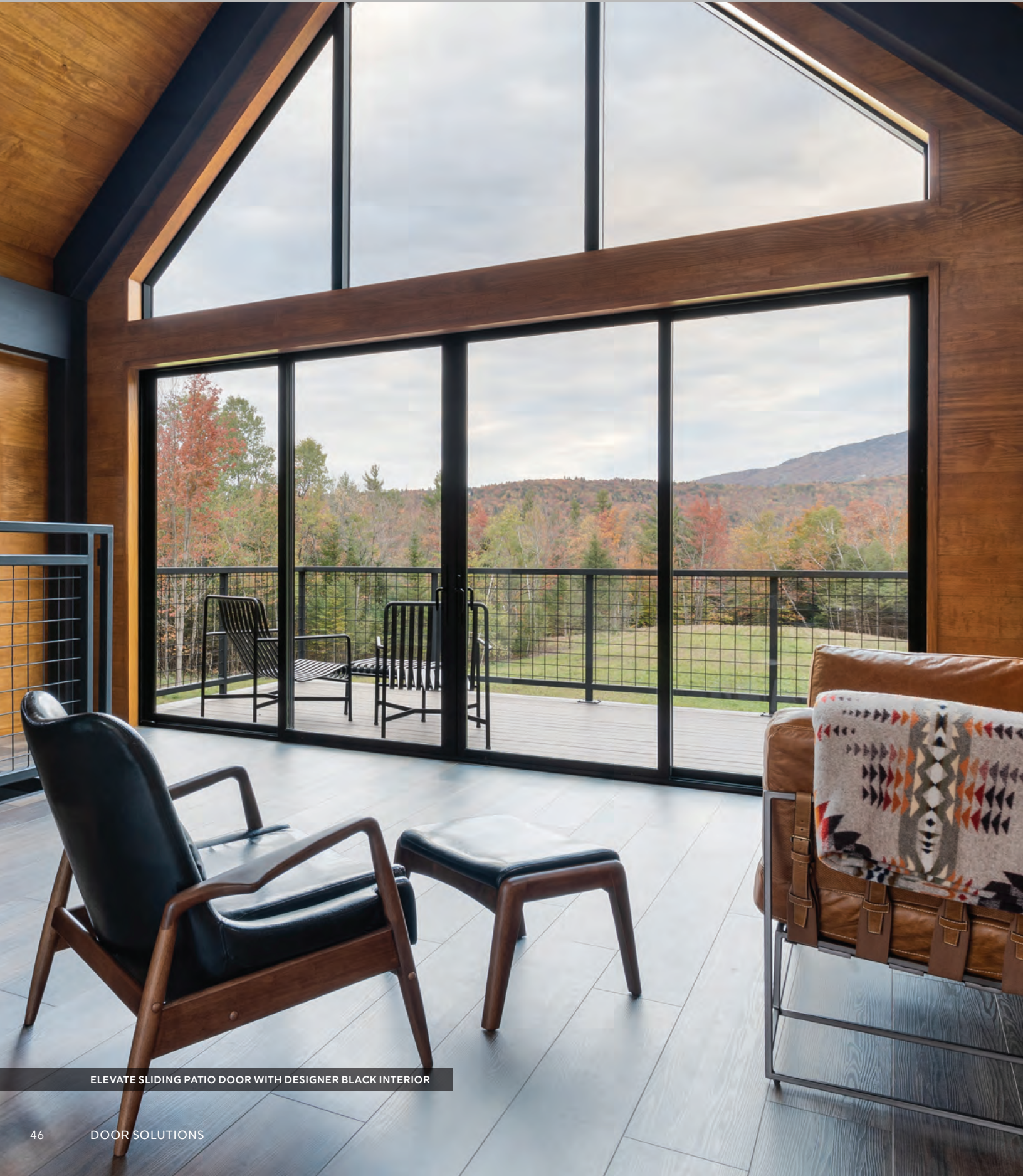
ELEVATE SLIDING PATIO DOOR WITH DESIGNER BLACK INTERIOR