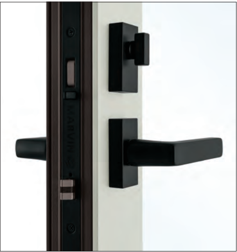
LEVER HANDLE IN MATTE BLACK