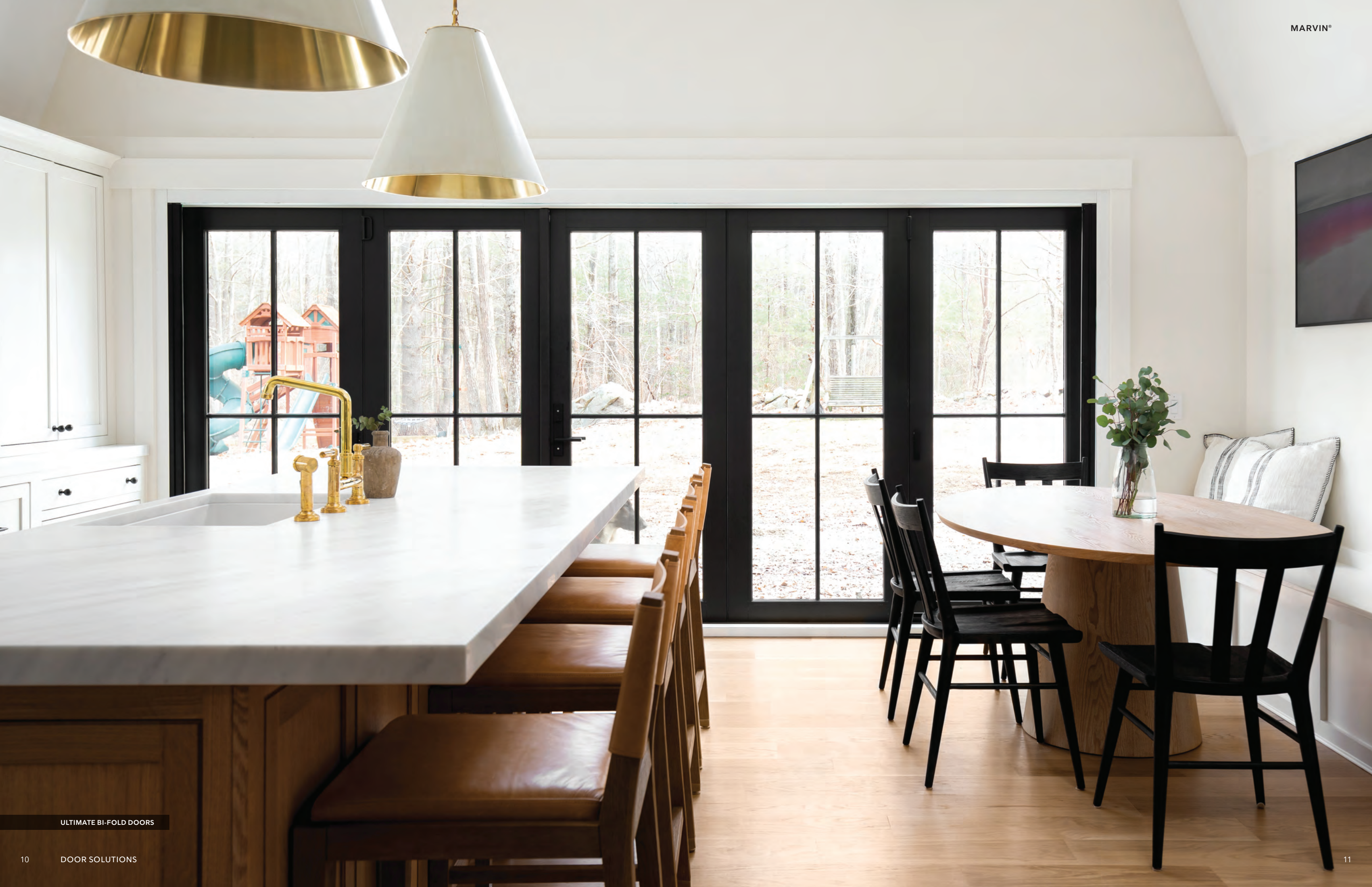
ULTIMATE BI-FOLD DOORS