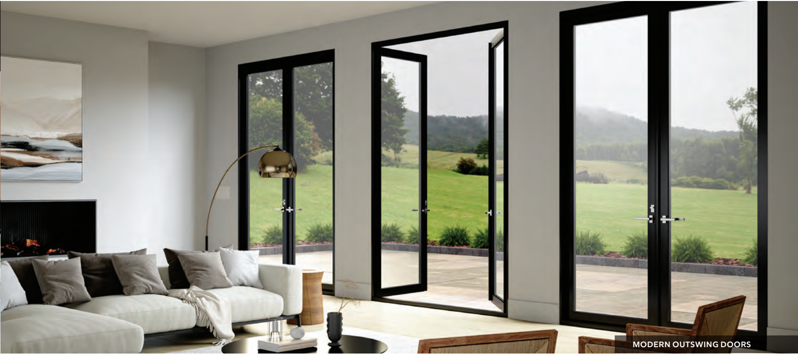
MODERN OUTSWING DOORS