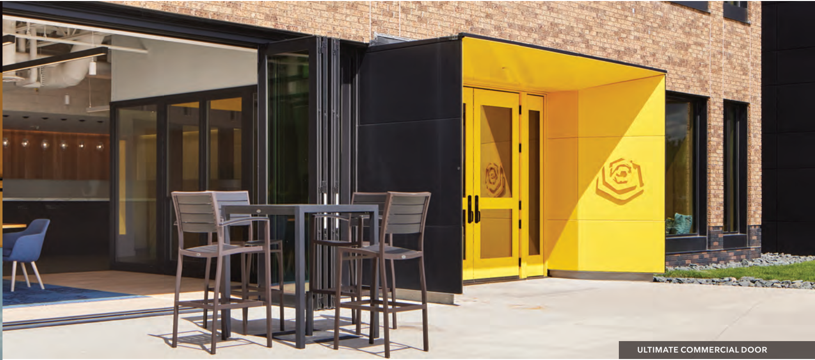
ULTIMATE COMMERCIAL DOOR