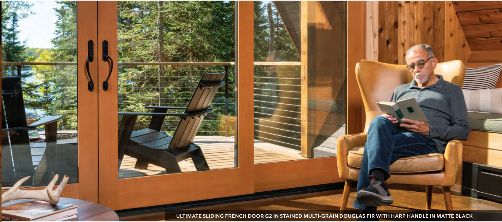
ULTIMATE SLIDING FRENCH DOOR G2 IN STAINED MULTI-GRAIN DOUGLAS FIR WITH HARP HANDLE IN MATTE BLACK