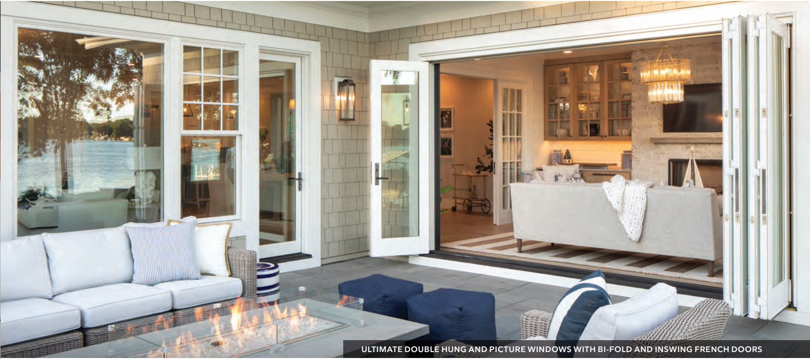
ULTIMATE DOUBLE HUNG AND PICTURE WINDOWS WITH BI-FOLD AND INSWING FRENCH DOORS