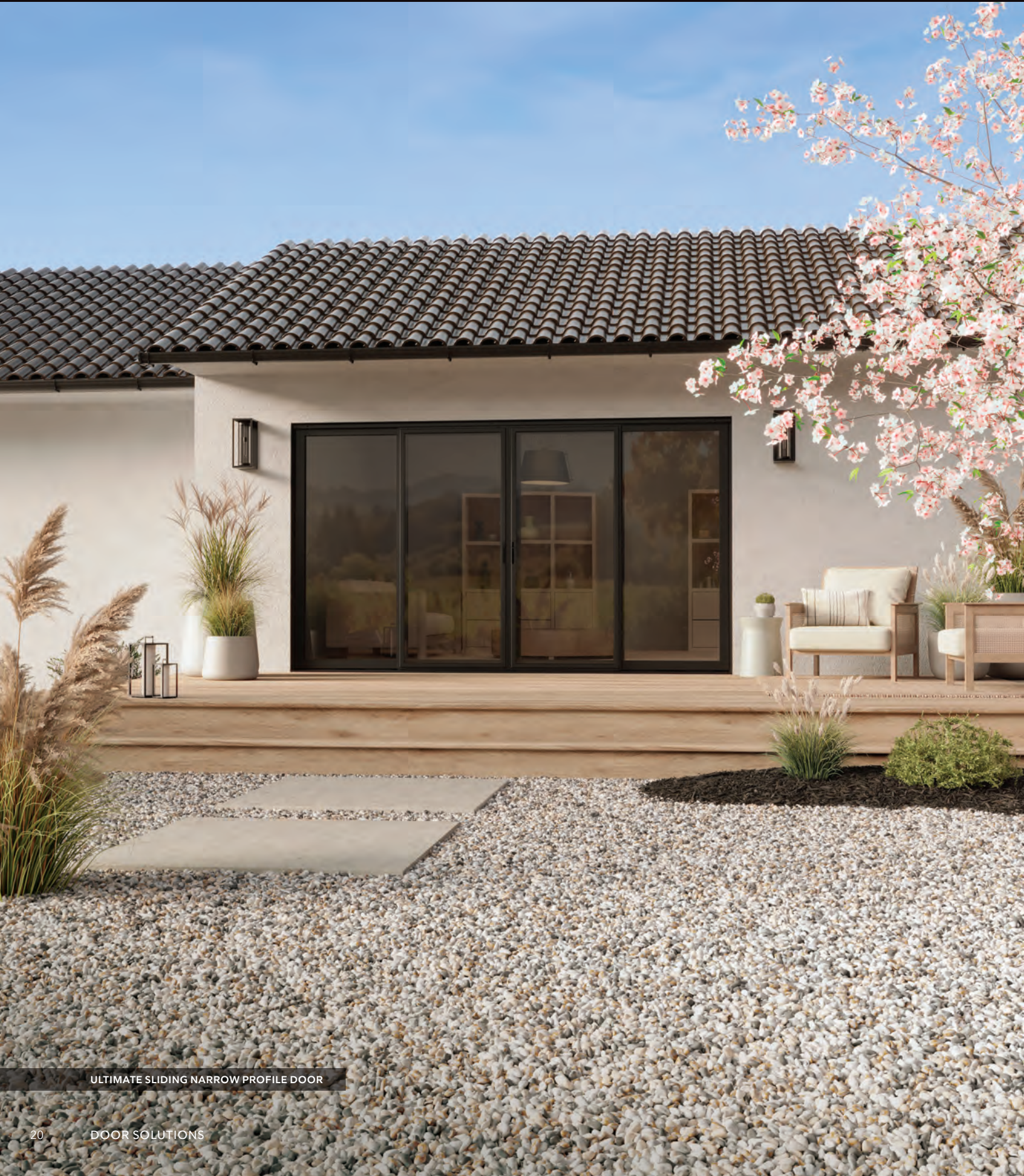
ULTIMATE SLIDING NARROW PROFILE DOOR