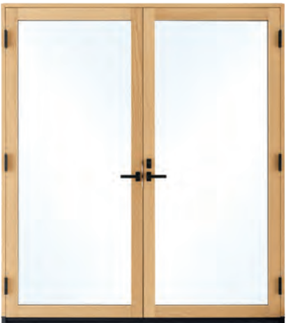
INTERIOR VIEW OF INSWING

The Ultimate Swinging Narrow Profile door, available as both inswing and outswing, is expertly crafted to provide industry-leading performance with narrow sightlines. Select sizes up to 10 feet high and 14 feet wide with robust 2 ¼ inch standard panel thickness. Dual panel doors available in equal or unequal panel widths. This door comes with square interior and exterior glazing profiles for a contemporary look and has an optional ogee glazing profile for a more traditional aesthetic.