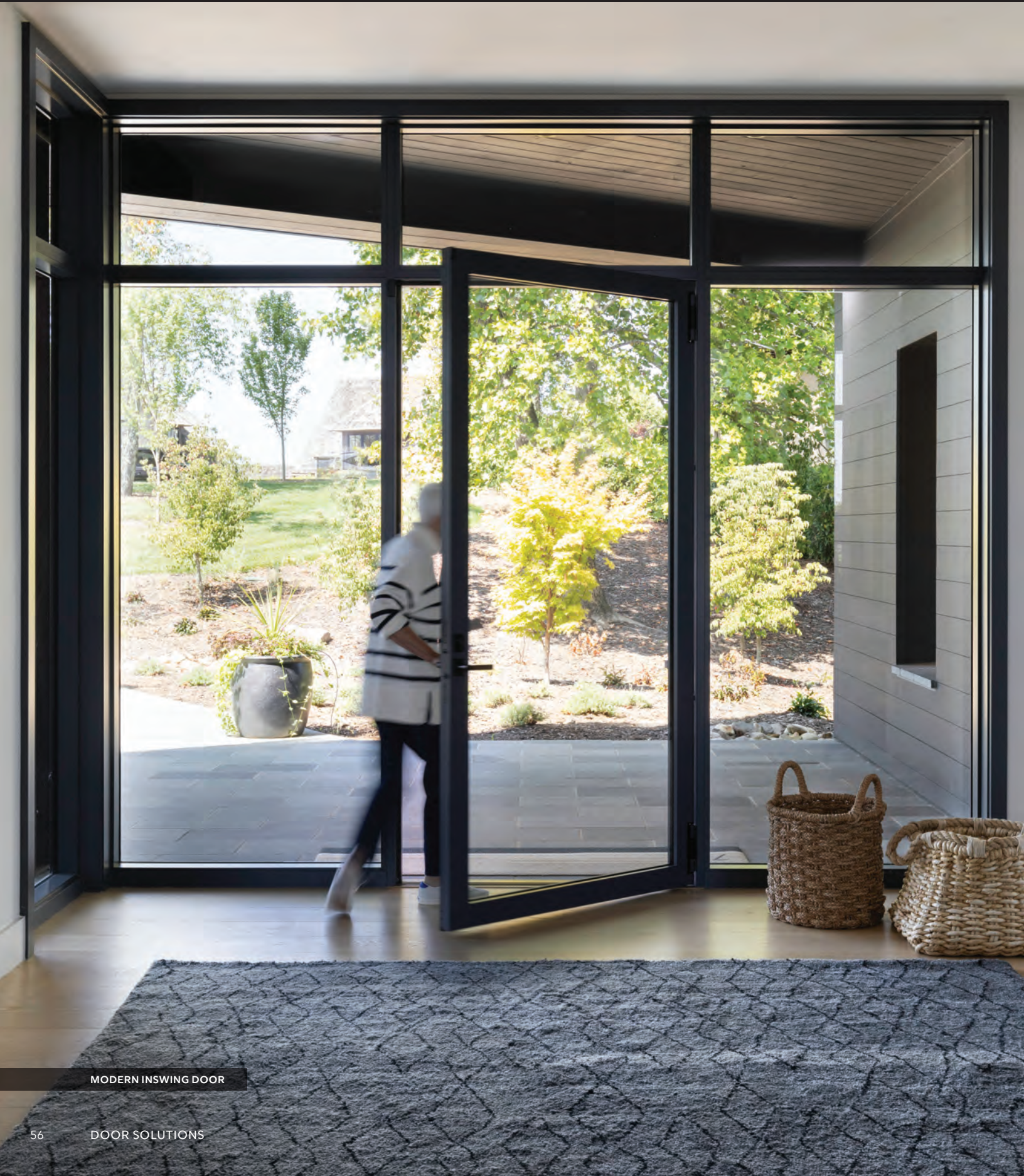
MODERN INSWING DOOR