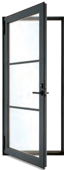
EXTERIOR VIEW OF OUTSWING

The Modern Swinging door pairs pure modern aesthetic with best-in-class performance for design flexibility to create with confidence. Available as both inswing and outswing, our Modern Swinging door is engineered with the same innovative modular system that allows Modern products to be mulled together, making it possible to create large, floor-to-ceiling configurations without sacrificing thermal performance even in the most demanding climates.