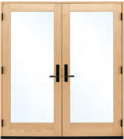
INTERIOR VIEW OF INSWING

The Ultimate Swinging French door G2, available as both inswing and outswing, delivers a traditional aesthetic with 4 ¾ inch top rail and either a 8 ⅛ inch or 4 ¾ inch bottom rail. Select sizes up to 10 feet high and 14 feet wide to maximize views and access to the outdoors. Choose up to 4 panels with an ogee or square interior glazing profile.