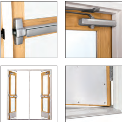
PANIC RIM, CLOSER, REMOVABLE MULLION, AND SILL OPTIONS