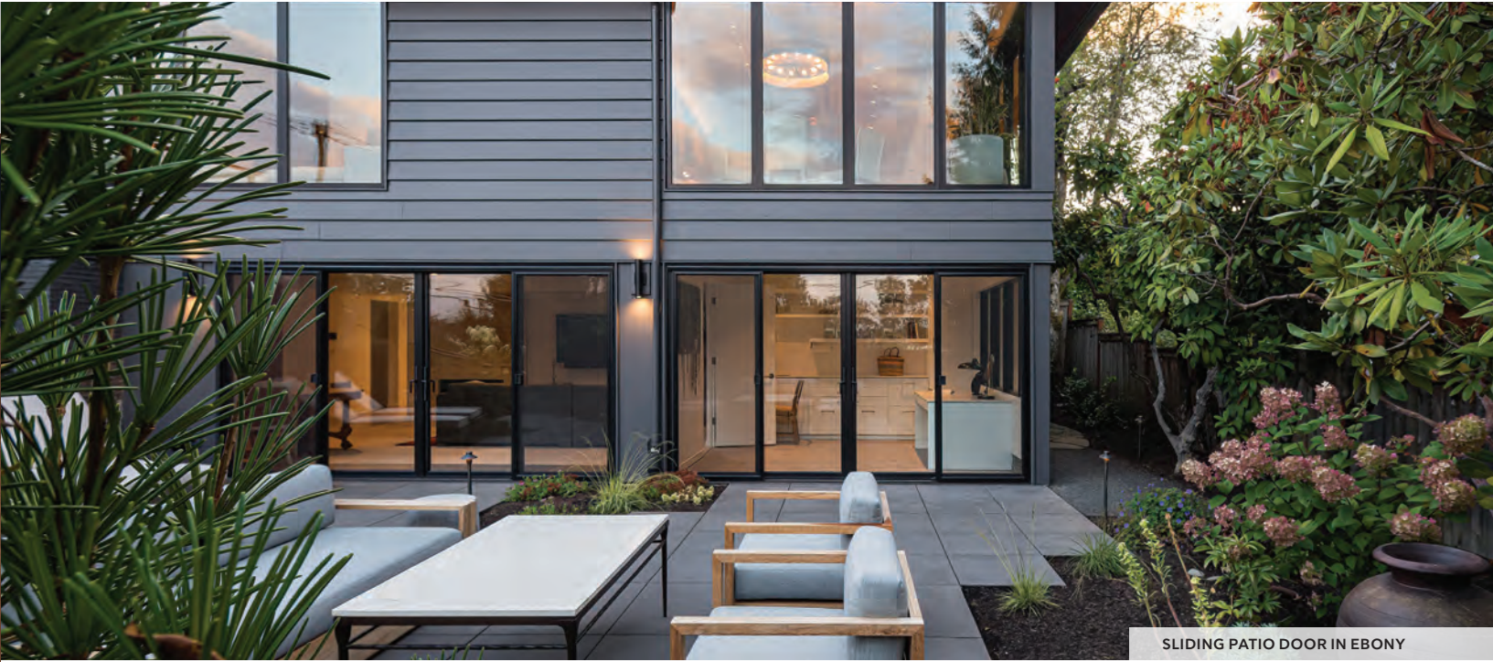
SLIDING PATIO DOOR IN EBONY

The Marvin Elevate Sliding Patio door offers contemporary lines and large expanses of glass, complemented by a rich wood interior and the durability of a Ultrex® fiberglass exterior for a sliding patio door that is as functional as it is beautiful. Select 2- or 3-panel configurations to achieve wide-open views up to 9 feet wide and a direct connection to outdoor living, all in a space-saving design when square footage is at a premium.