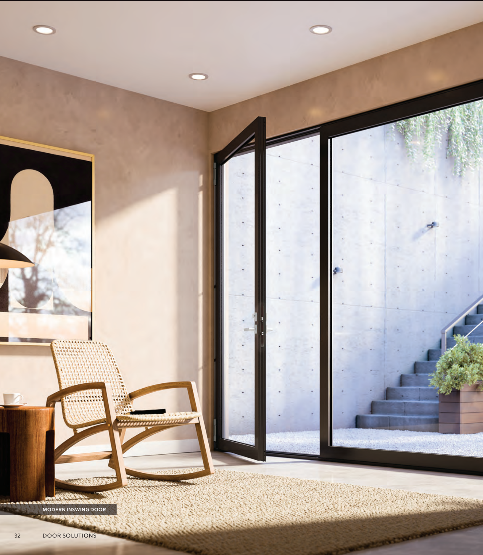
MODERN INSWING DOOR