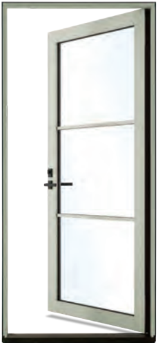
INTERIOR VIEW OF OUTSWING