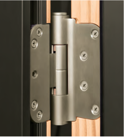
DOOR HINGE SHOWN IN SATIN NICKEL