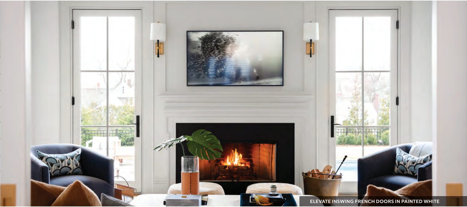
ELEVATE INSWING FRENCH DOORS IN PAINTED WHITE