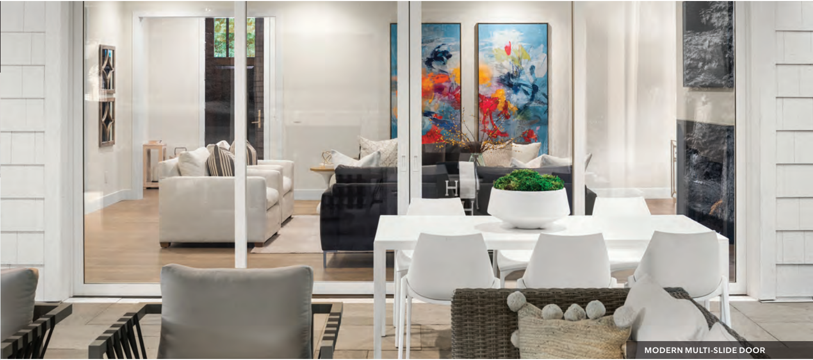
MODERN MULTI-SLIDE DOOR