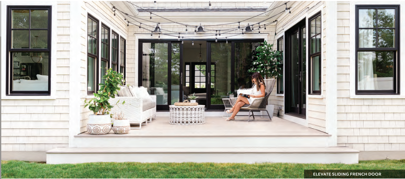
ELEVATE SLIDING FRENCH DOOR