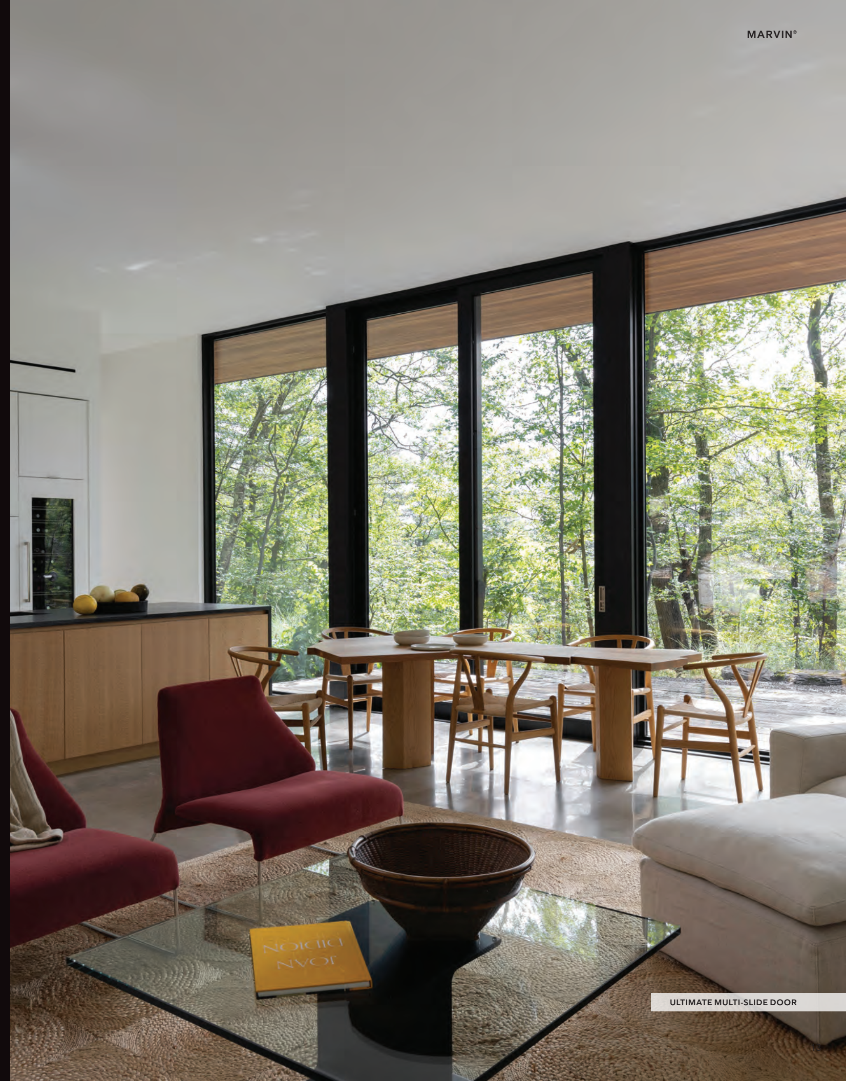
ULTIMATE MULTI-SLIDE DOOR

Our Ultimate product line unites beautiful design with exceptional handcrafted quality. Add character to almost any space with our most extensive selection of shapes, styles, sizes, and options—including wood interiors protected by tough aluminum clad exteriors. With nearly endless possibilities for customization, Ultimate can match your vision and give it room to grow.