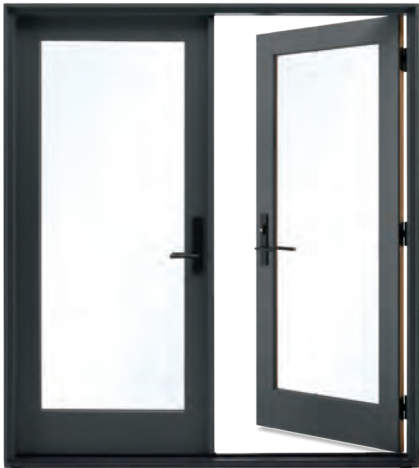
EXTERIOR VIEW OF INSWING