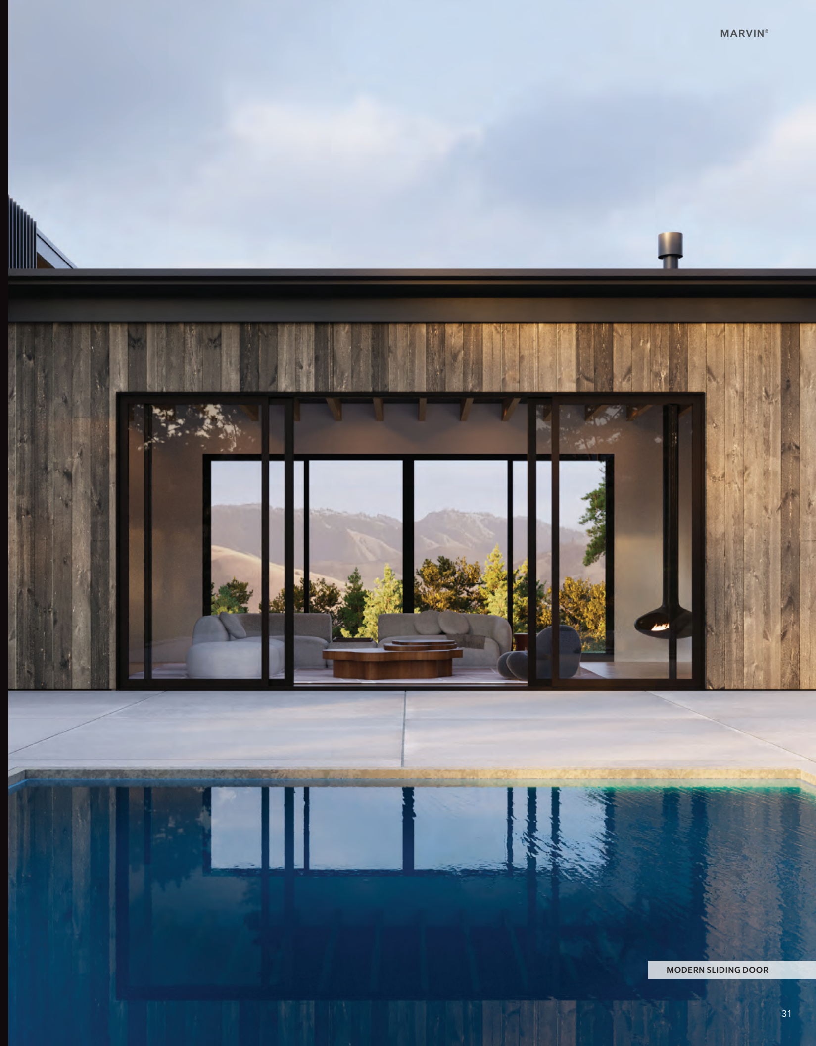
MODERN SLIDING DOOR

Marvin Modern brings exceptional design, performance, and customer experience together, creating a product line that meets the exacting principles and standards of true modern architecture. Innovative Marvin High-Density Fiberglass exteriors, leading thermal performance, consistent narrow sightlines, and a modular system all add up to the Modern product line—a seamless approach to modern design.