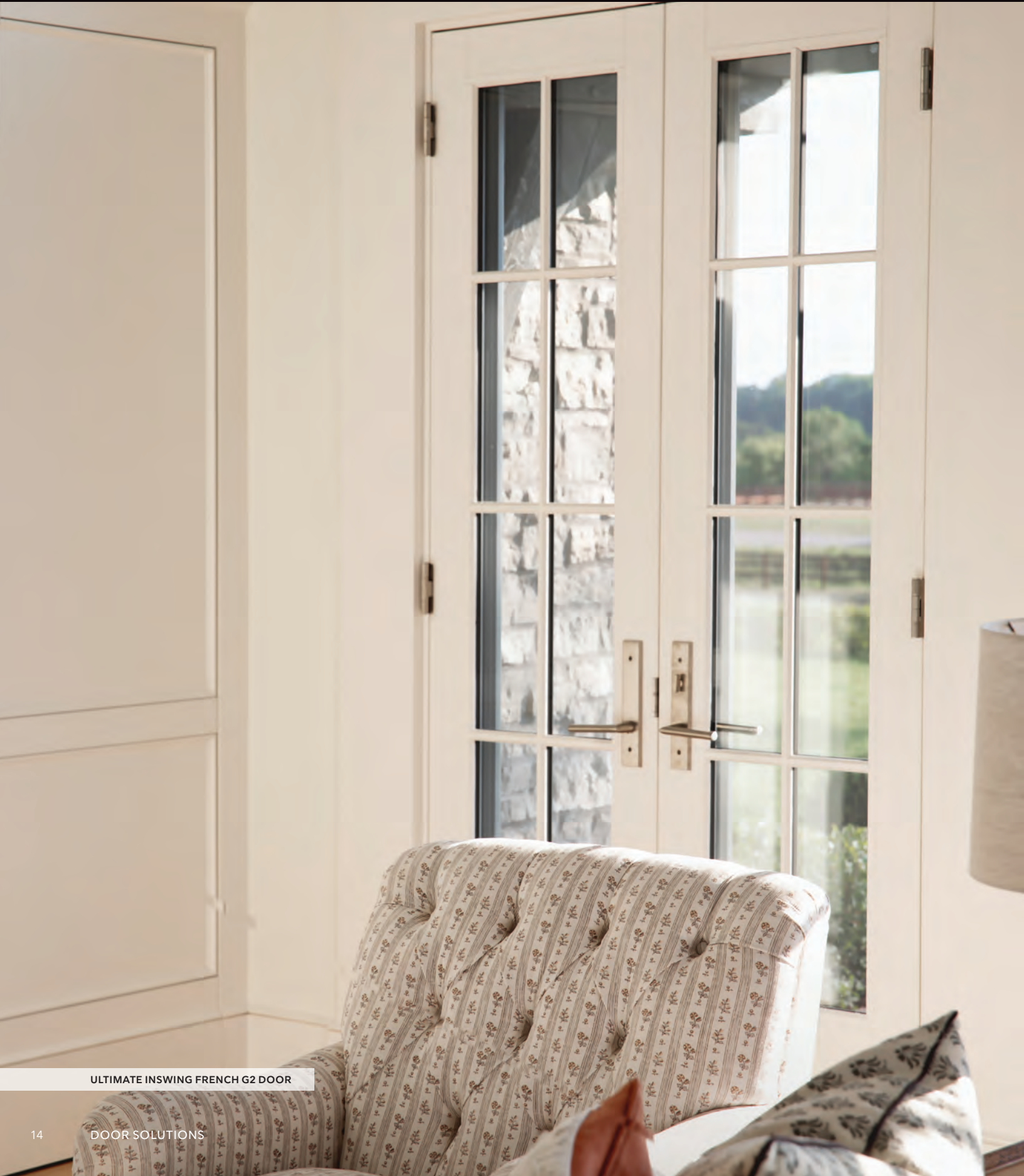
ULTIMATE INSWING FRENCH G2 DOOR