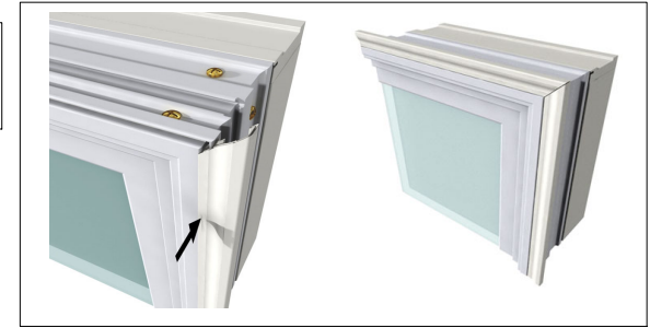
Figure 1: Pressing on the J-Channel