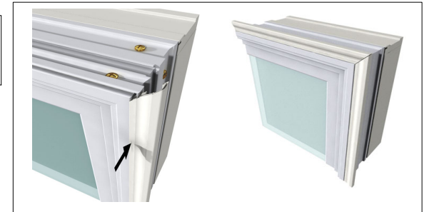
Figure 1: Pressing on the J-Channel