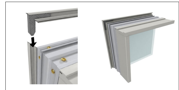
Figure 2: Inserting corner key