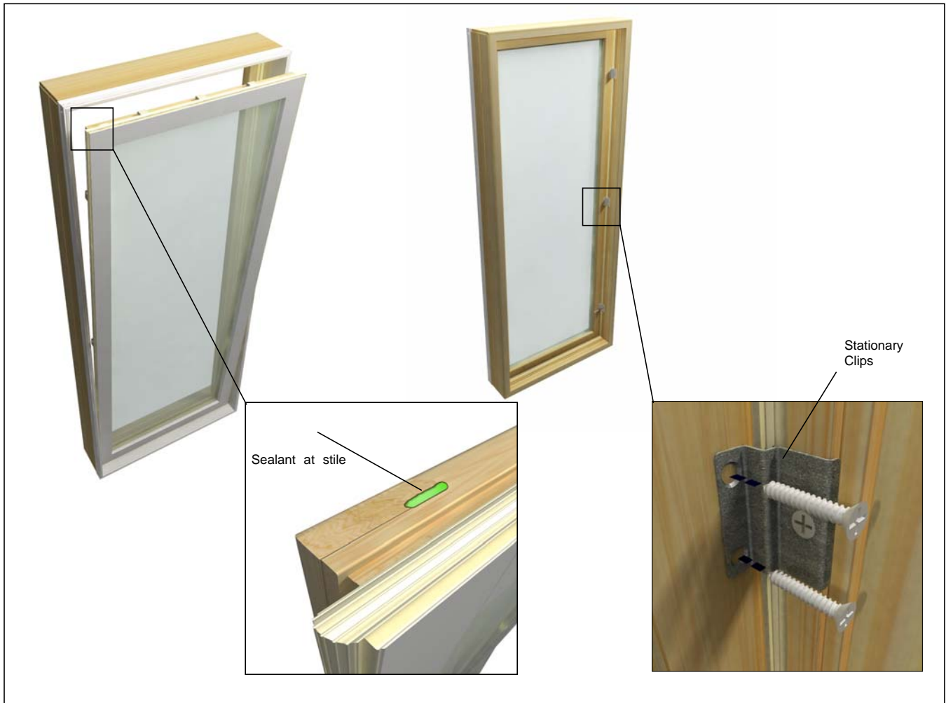
Figure 3 Installing stationary sash and fastening in frame.