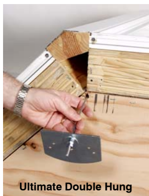
Ultimate Double Hung

UDH sill shown for illustrative purposes