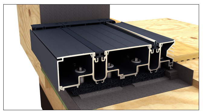
Figure 1 Open face slot with wood construction. Slot recess is 3/8" (10). Available flooring is 2" (51) however 3/4" (19) hardwood flooring is used leaving 1 1/4" (32) sill face exposed.

The slot required for the recessed Performance Sill system should be within 1/4" (6) level across the door opening. The key element is that the finished floor height and finished floor thickness must be accounted for prior to preparing the slot. The dimensions of the open face slot are determined by the configuration of the Lift and Slide door system to be installed, as well as the available 0" - 2" (0 - 51) floor thickness. See illustrations below for examples.