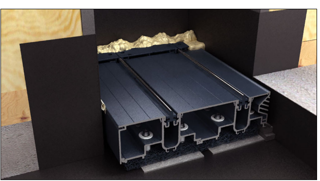
Figure 4 Pocket with open face slot in concrete with a 2 3/8" (60) slot recess leaving 0" available floor thickness. The concrete is the finished floor and flush with the top of the sill.