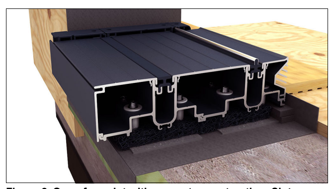
Figure 2 Open face slot with concrete construction. Slot recess is 3/8" (10). Available flooring is 2" (51) however 3/4" (19) hardwood flooring is used leaving 1 1/4" (32) sill face exposed.